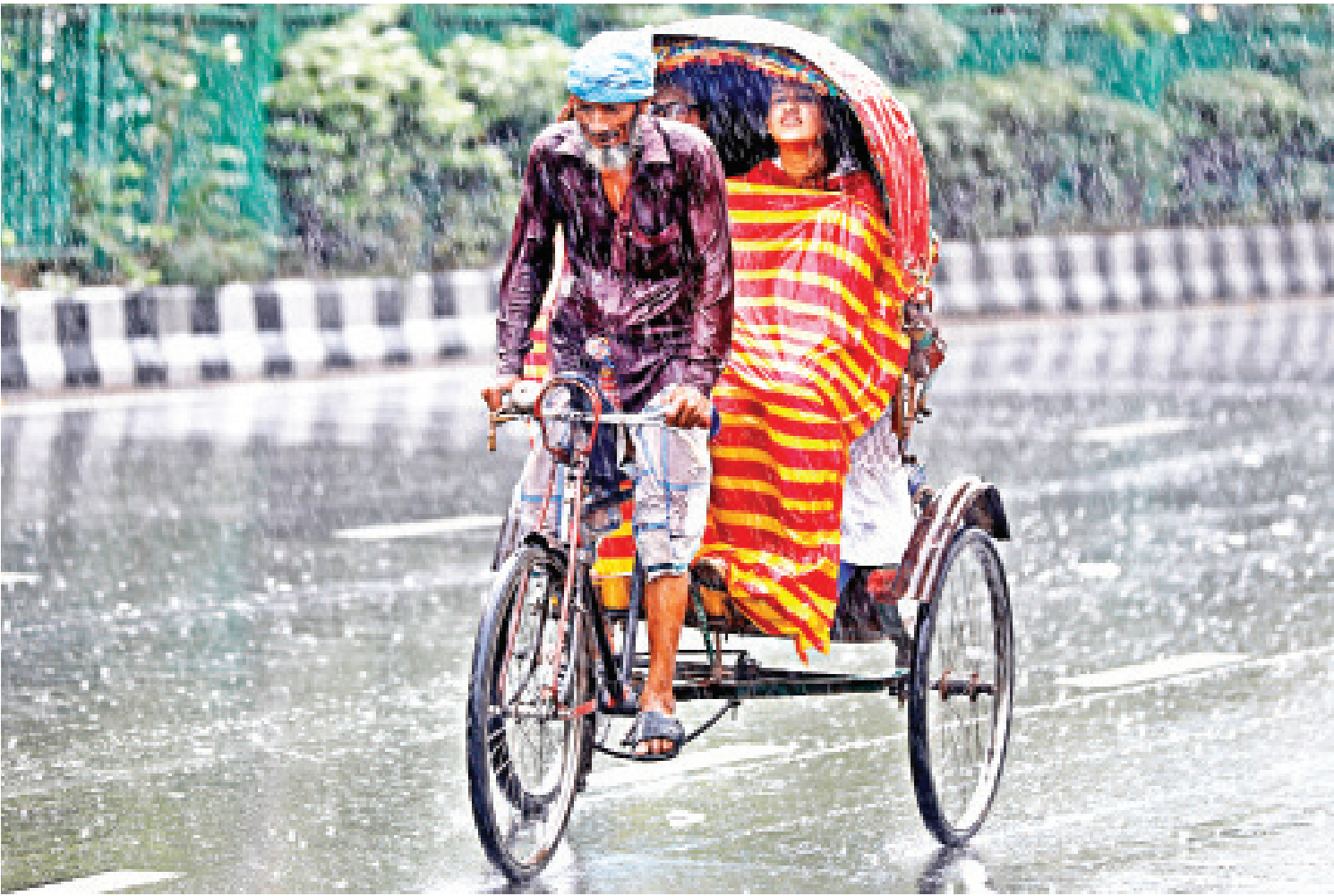
Amid the ongoing heatwave, a sudden drizzle surely brings a sigh of relief, as is evident in the smiles of a rickshaw-puller and the passenger. This photo was taken on Satmasjid Road yesterday.