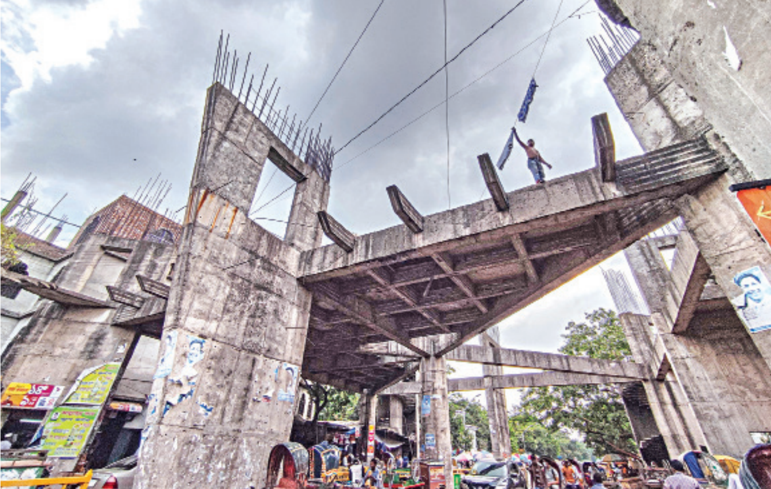
To commemorate the martyrs of the Language Movement, a gate was supposed be constructed beside Dhaka Medical College. However, many years have passed since the construction work got halted. At present, the unfinished structure is being used by locals to hang their clothes, while many plaster its surface with posters. This photo was taken at Aamtola area recently.