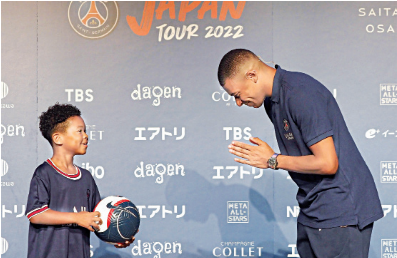
PSG's Kylian Mbappe greets a jubilant young fan during a press conference in Tokyo on Sunday. The Ligue 1 champions are slated for three games with local Japanese clubs as part of their pre-season tour.

SPORTS REPORTER Stuart Law, who had served as head coach of the Bangladesh national team in 2011-2012, was appointed as under-19 team's head coach, and yesterday he spoke to the media during a press conference. The Australian said he wanted to make contributions to grassroots cricket to help cricketers' overall growth. "I have done some jobs as head coach around the world and as head coach of an international team; you don't do a lot of coaching. It's mainly a lot of talking and administration work. This gives me the opportunity to get back and work on the grassroots, an area I believe I can help make a difference. Not just cricketing abilities but help them grow as a young person and as a person. When the opportunity came, it was pretty easy to say yes," Law said on his return, having also served as consultant for the under-19 side in 2016. The ICC U-19 World Cup will be Law's major priority with the team. "We have a lot of games before the World Cup, which is 18 months away. We will understand how to play once we understand our squad better. It's about managing expectations of the players too," Law said. While the focus was on white-ball cricket for the U-19 World Cup, Law believes that improvement in the longer format should be the top priority. "I think it's critical for the young players' development to play the long format. I believe the best players come