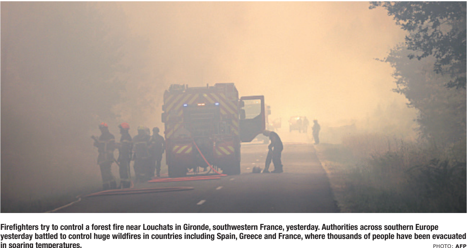
Firefighters try to control a forest fire near Louchats in Gironde, southwestern France, yesterday. Authorities across southern Europe yesterday battled to control huge wildfires in countries including Spain, Greece and France, where thousands of people have been evacuated in soaring temperatures.