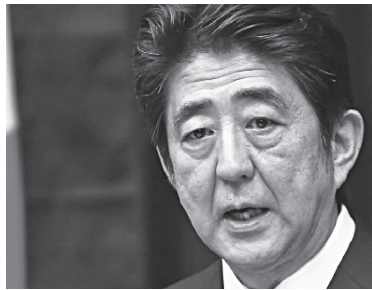
Shinzo Abe (1954-2022)

His desire to see Japan expand its sphere of influence was amply reflected in the unusually busy international schedule he adopted. From December 2012 to September 2014, Abe visited an astonishing 49 countries, including Bangladesh. Keen to unshackle his country from the constraints of its post-war constitution, Abe positioned Japan