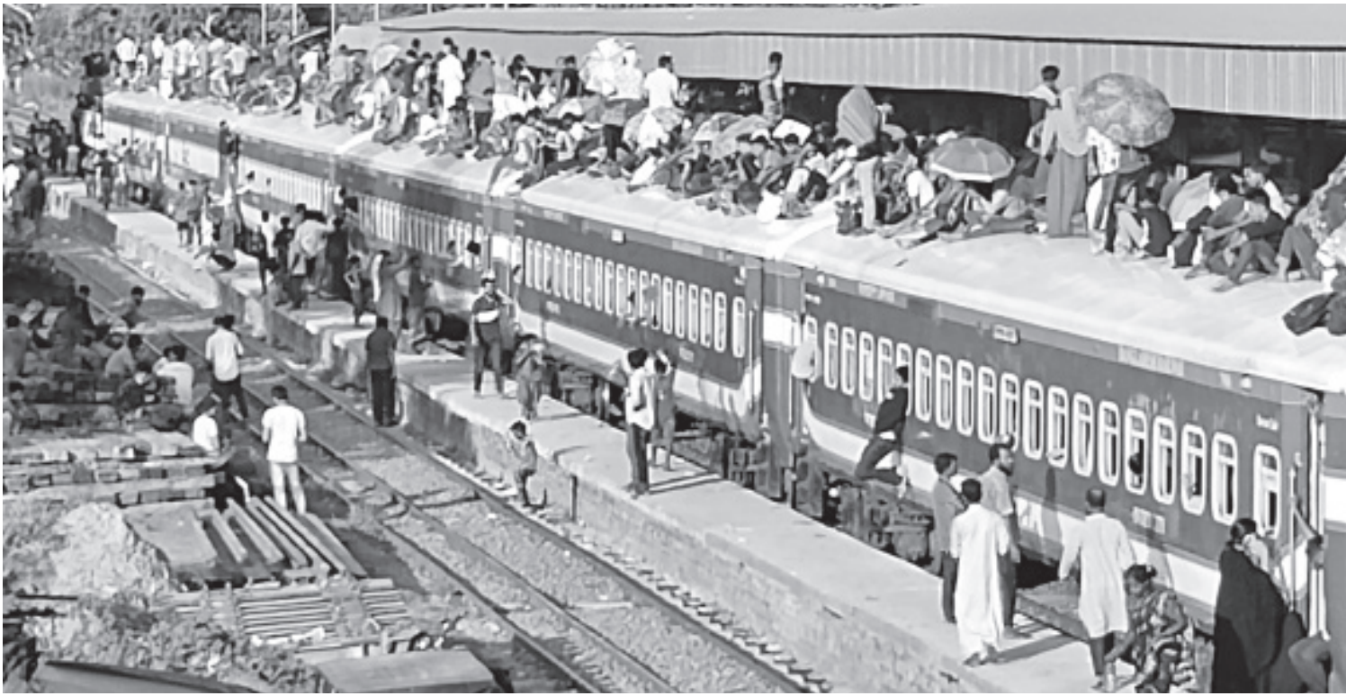
Dhaka-bound passengers from the country's northern regions had to go through a painful wait yesterday, as trains on Dhaka-Panchagarh route got delayed for almost six hours due to a technical glitch. Many were seen sitting on the train rooftop with umbrellas, while others stepped out of the train and waited on the platform. Railway officials blamed the disruption on the huge number of passengers, saying that they're not being able to provide better services due to the overload. This photo was taken at Chatmohor Railway Station in Pabna in the afternoon.