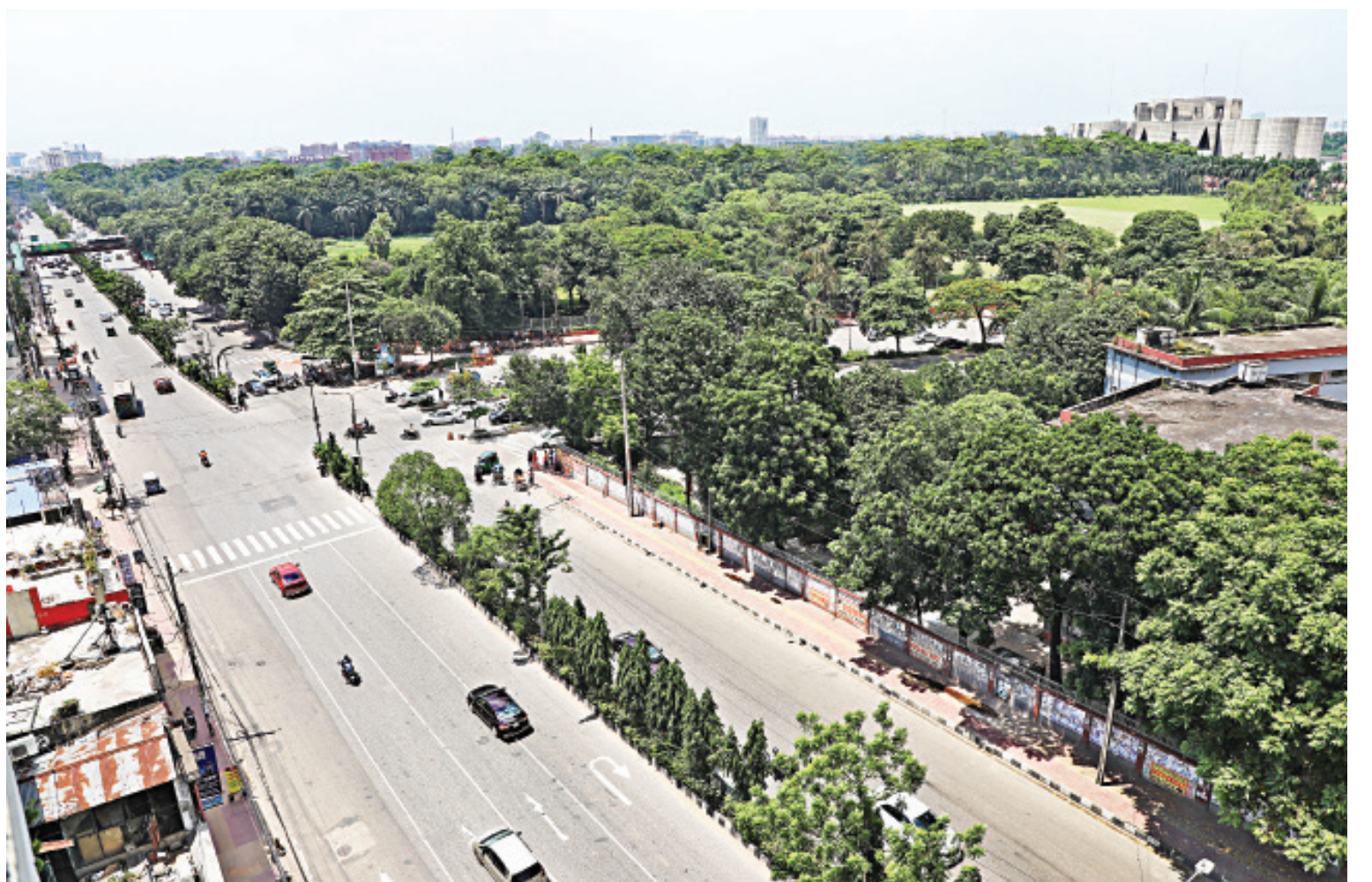
Dhaka residents are witnessing the final moments of a relatively empty city, when roads are devoid of the usual gridlocks and tailbacks. As the holidays have come to an end, many are returning to the city to resume their busy, urban life. This photo was taken on Mirpur Road yesterday.