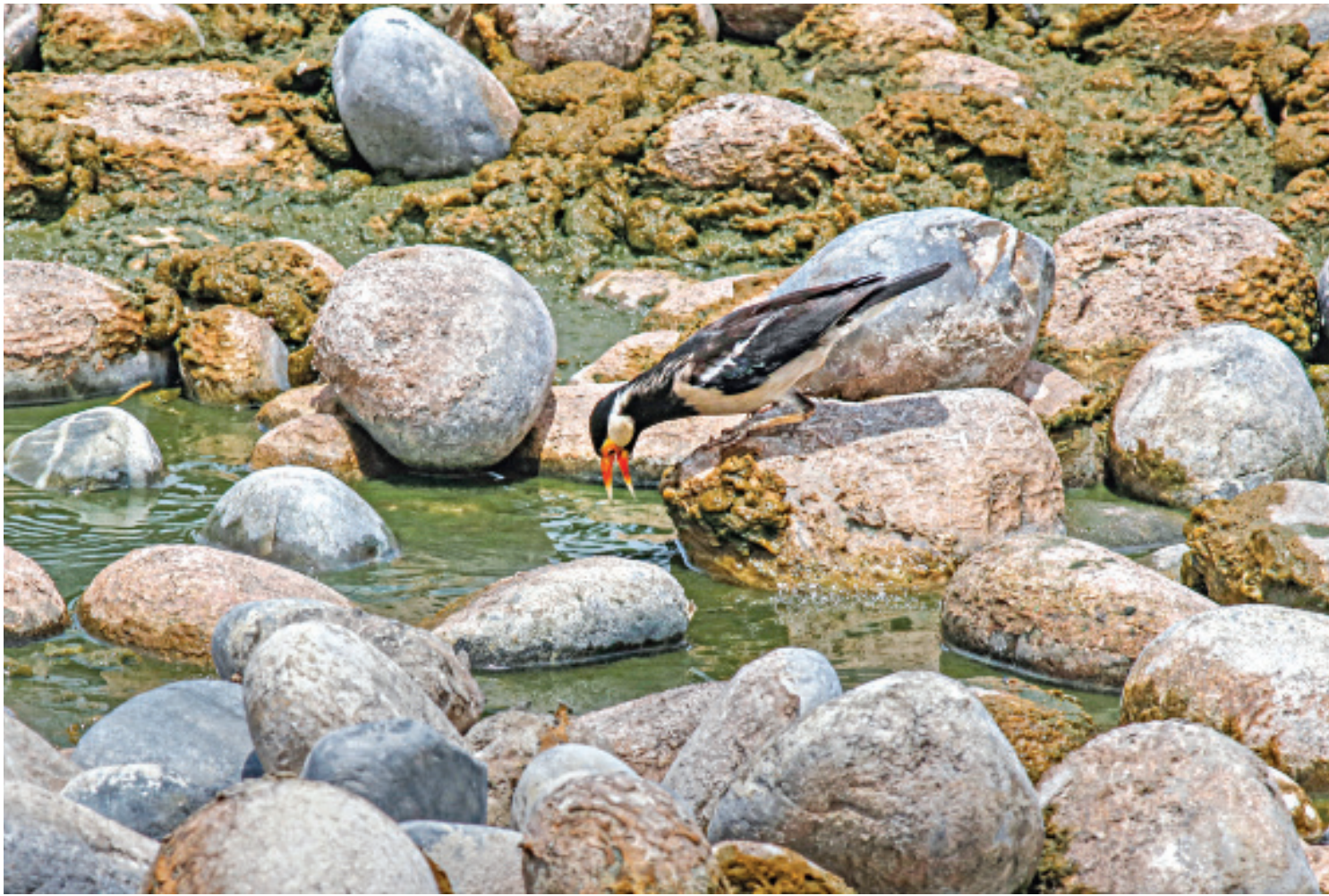
While water remains always available for people, for the city's birds, it is something that needs to be searched for every day. And so, this feathered friend was spotted quenching its thirst at a creek in Suhrawardy Udyan amidst the heat yesterday.