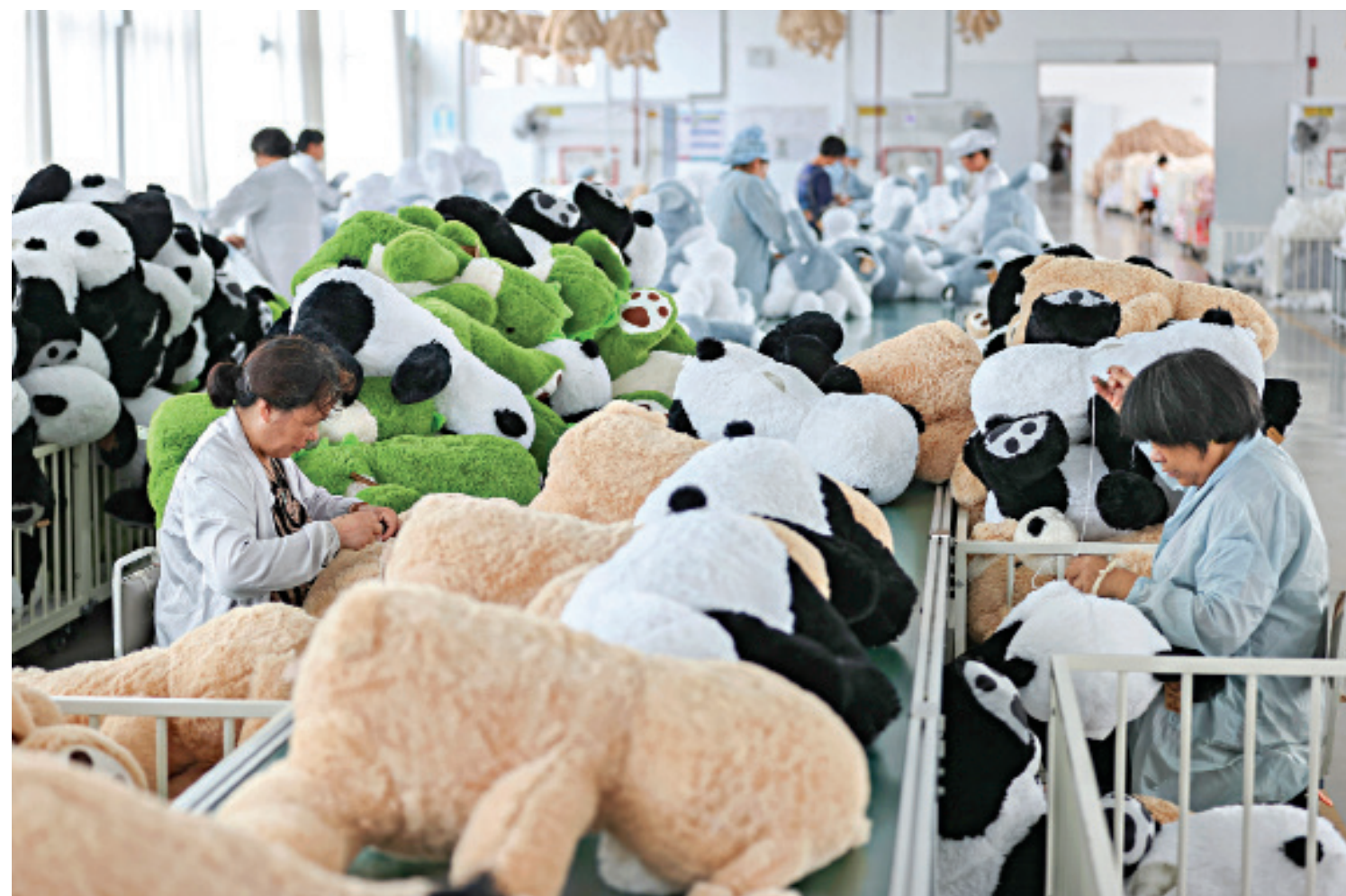
Workers produce stuffed toys for export at a factory in Lianyungang in China's eastern Jiangsu province on July 7.