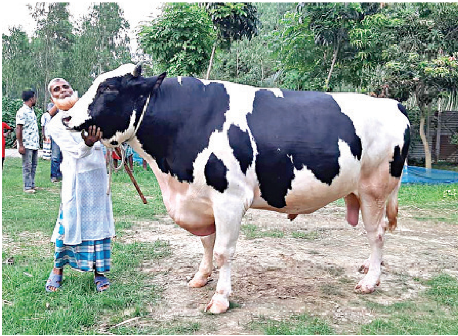
Farmers in northern districts of the country had expected to rake in hefty sums by selling large animals such as this behemoth of a bull at cattle markets centring the recent Eid-ul-Azha. However, they had to make do with poor profits as prices exceeded the people's buying capacity.

There were 7.23 million tonnes of crude palm oil in storage tanks at the end of May, data from the Indonesian Palm Oil Association (GAPKI) showed on Friday.