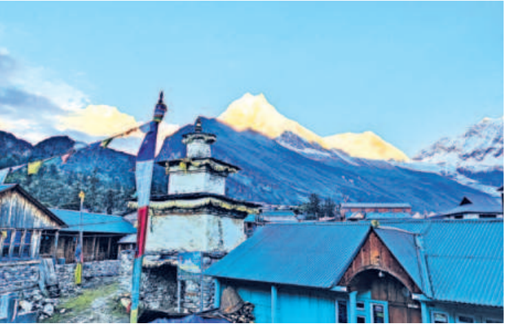
A view of Mt Mansalu from Shayla village.