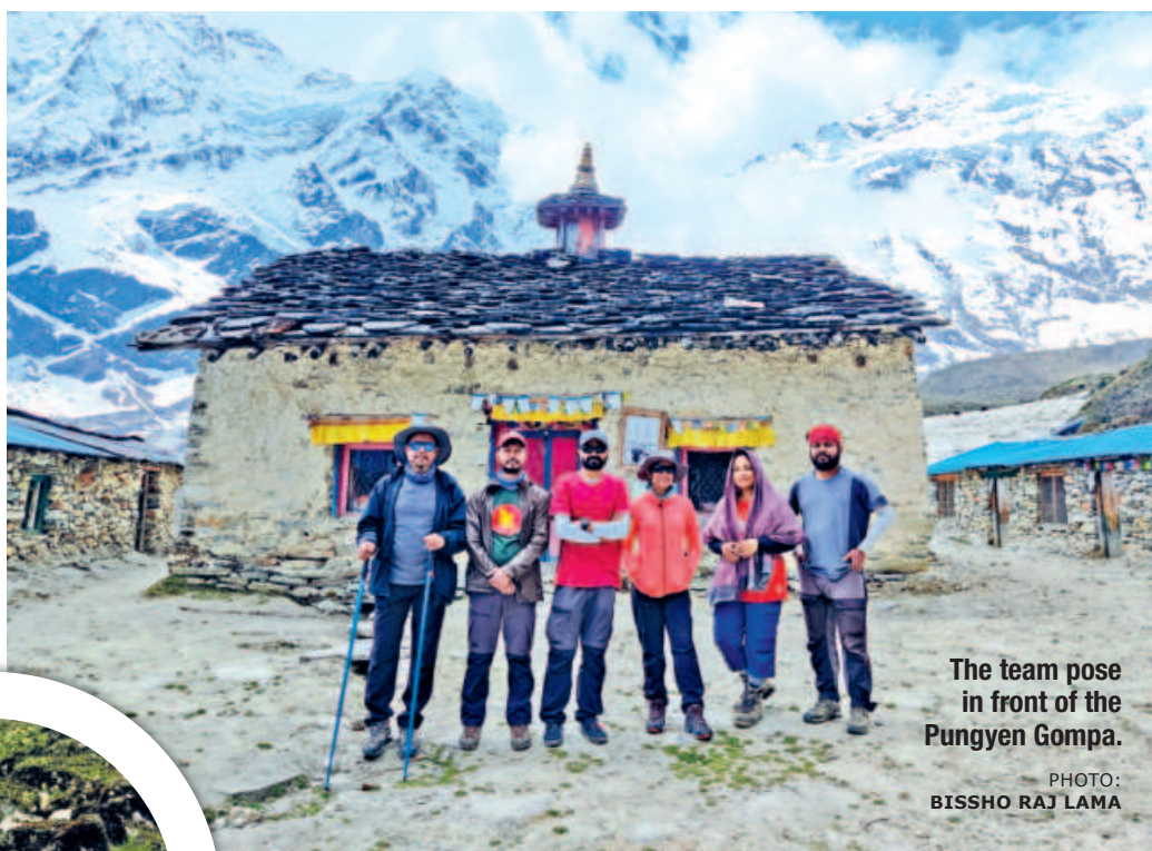
The team pose in front of the Pungyen Gompa.

I am on a mission. A couple of years ago I developed this crazy urge to explore the great arc