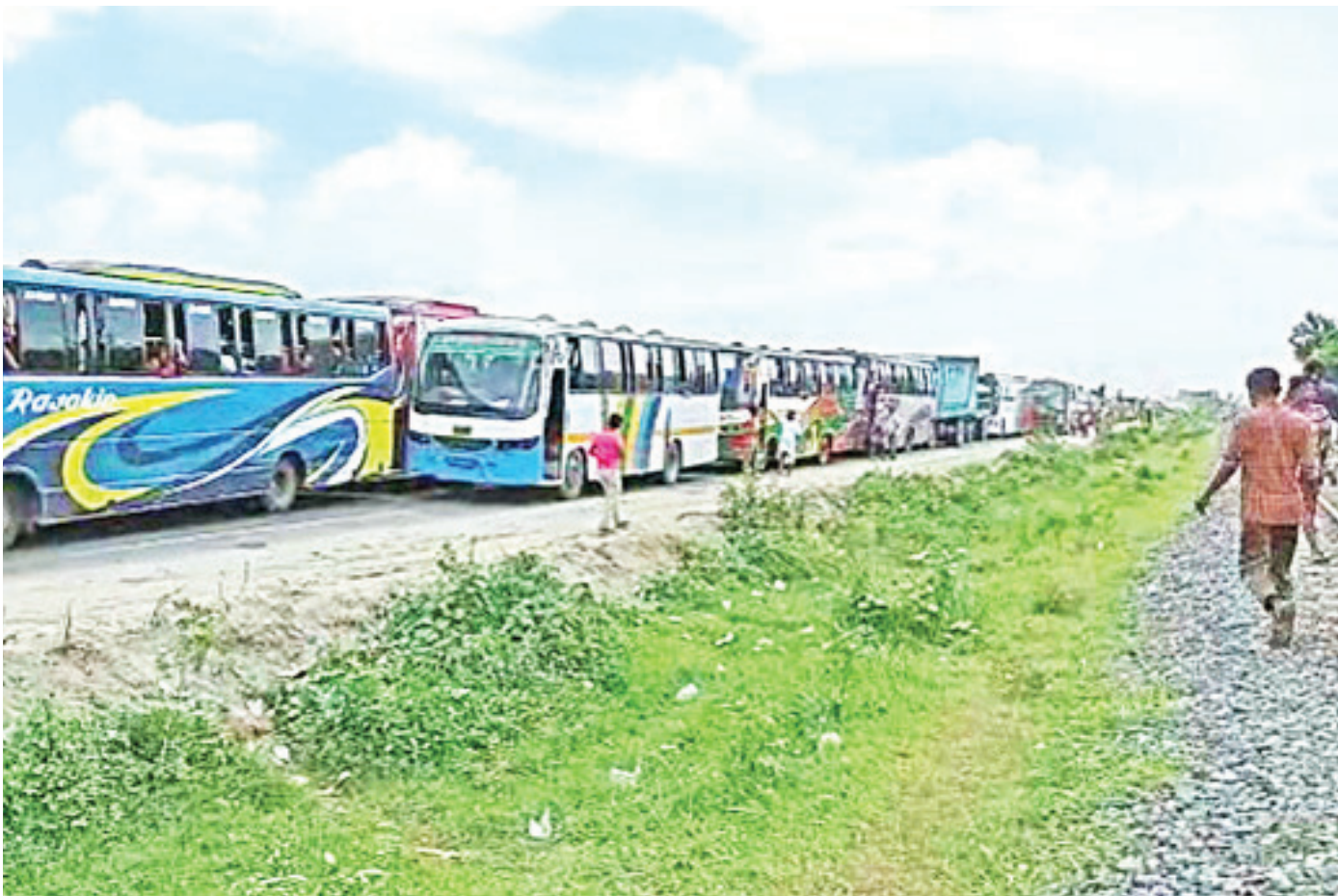
Vehicular movement on Bangabandhu Bridge's east approach road in Tangail has been almost standstill yesterday due to heavy traffic and a truck flipping over. People returning to Dhaka after Eid holidays waited hours in the heat . The photograph was taken yesterday afternoon.