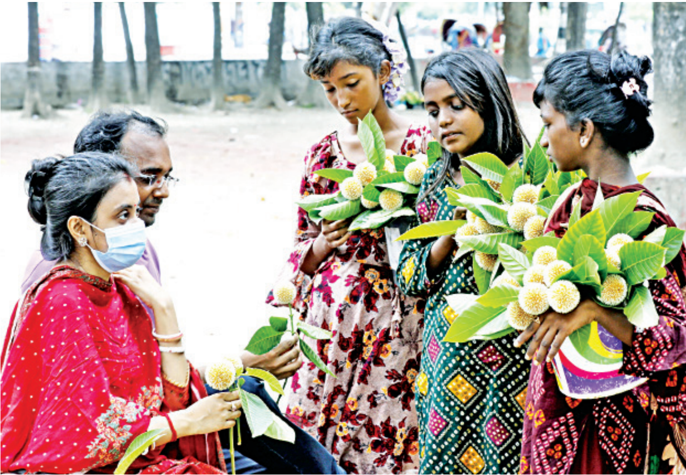
As many Eid holidaymakers are yet to return to the capital, public places are less crowded. With customers sparse, three children are seen trying to sell burflowwers to one couple at TSC of Dhaka University yesterday.