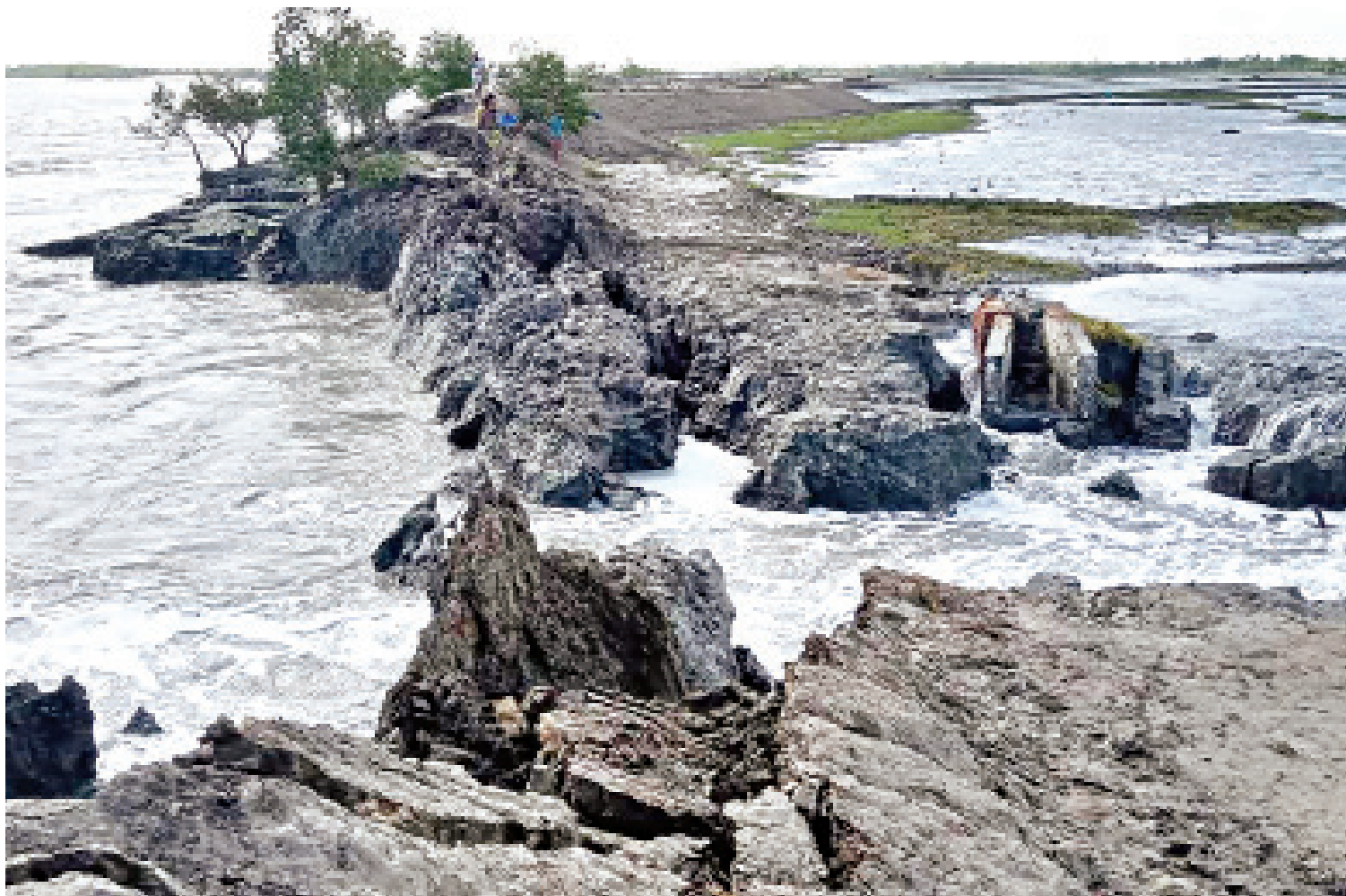
The collapse of the 150-foot embankment at Durgabati point in Kholpetua River left hundreds of people marooned, inundated croplands and washed away shrimp enclosures. Four villages of Satkhira's Shyamnagar upazila have been submerged due to the embankment's collapse.