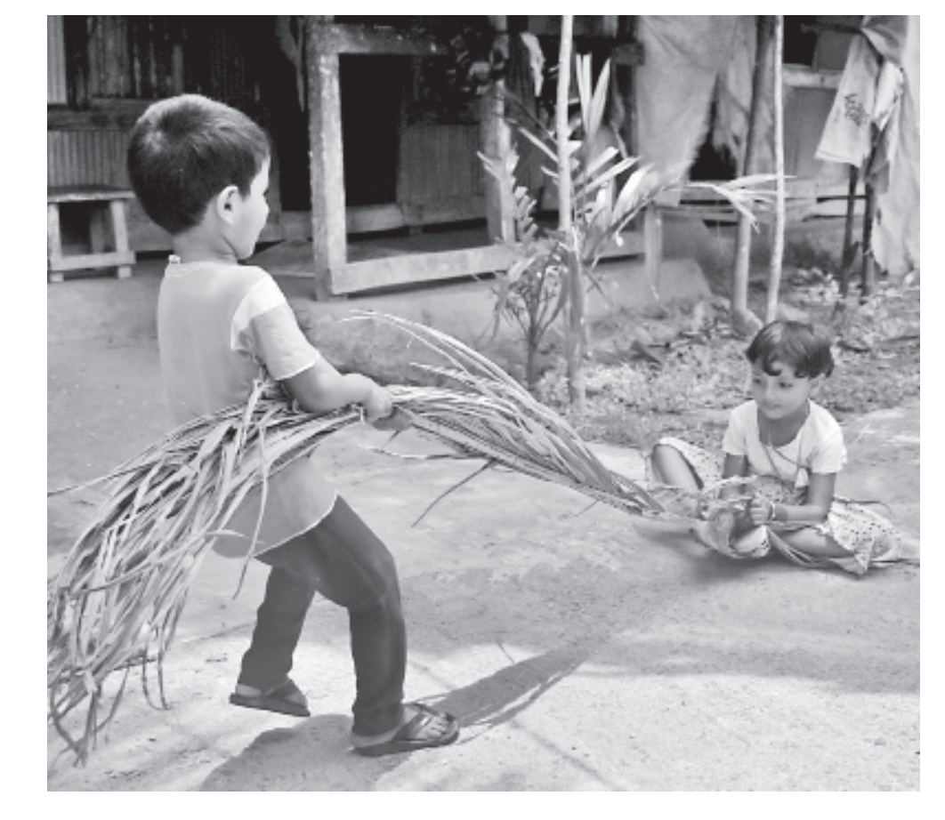
A toddler pulls one end of a coconut tree leaf, while his sister sits on the other end -treating the large leaf like a sleigh. Even in the modern day, this age-old traditional game remains ever popular in the rural regions of the country. This photo was taken from Muslim Para in Pirojpur yesterday.