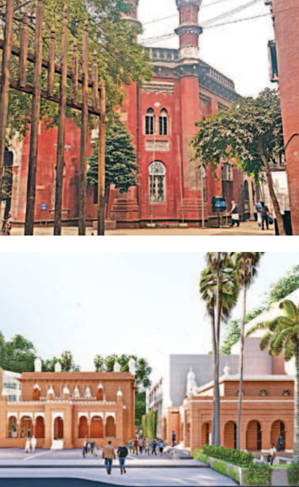
Top, the current state of historic Lalkuthi and the library inside. Bottom, the proposed designs for the renovation.

DSCC to restore its original design, make library functional again