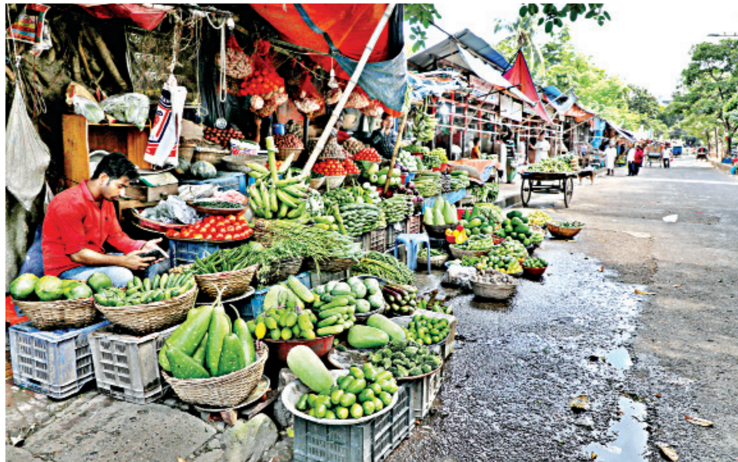
With just days having passed since the recent Eid-ul-Azha celebrations, vegetable traders across Dhaka are yet to see an adequate customer turnout as people are yet to return to their daily lives. The photo was taken yesterday from Hatirpool, a major market for groceries in the capital.

Stocks of ACI Ltd rose 0.32 per cent to Tk 279 at the DSE yesterday.