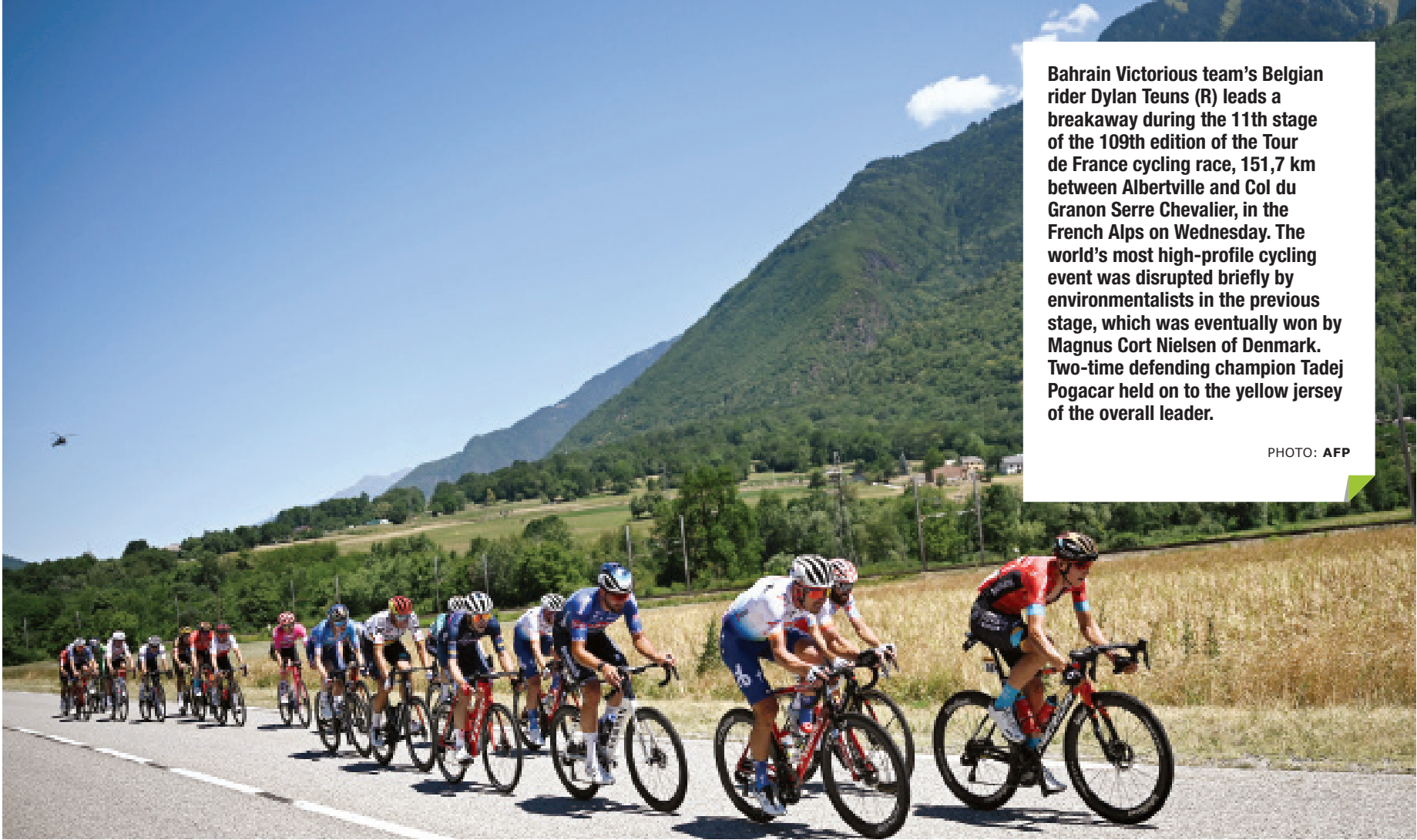
Bahrain Victorious team's Belgian rider Dylan Teuns (R) leads a breakaway during the 11th stage of the 109th edition of the Tour de France cycling race, 151.7 km from Albertville and Col du Granon Serre Chevalier, in the French Alps on Wednesday. The world's most high-profile cycling event was disrupted briefly by environmentalists in the previous stage, which was eventually won by Magnus Cort Nielsen of Denmark. Two-time defending champion Tadej Pogacar held on to the yellow jersey of the overall leader.

AFP, MANCHESTER Raheem Sterling has said he will leave Manchester City "a man" on Wednesday as his transfer to Chelsea edged ever closer. The 27-year-old posted a goodbye message on social media ahead of an expected £50 million ($59 million) move. Sterling announced his exit from the Etihad with a social media post thanking those he worked with at the club over the past seven years. "Seven seasons, eleven major trophies, a lifetime of memories," he posted on Twitter. "What a ride it's been." "I am thankful for the ups and the downs as it's the downs that have, at times, tested my strength and resolve and enabled me to stand here in front of you as the best possible version of myself." "I arrived in Manchester as a 20-year-old. Today, I leave a man. Thank you for your endless support. It's been an honour to wear the shirt of Manchester City." Sterling is set to become Chelsea's first signing since Todd Boehly's consortium bought the club. The England international won four Premier League titles among nine major trophies since joining City from Liverpool in 2015. A key player in the early years of Pep Guardiola's reign at City, Sterling scored 131 goals in 337 appearances for the English champions. However, his regular place in the starting line-up at City came increasingly under threat from the signing of Jack Grealish for a Premier League record £100 million last year, plus the emergence of Phil Foden from the club's academy.