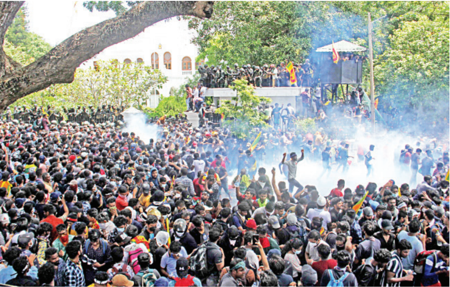
Demonstrators take part in an anti-government protest outside the office of Sri Lanka’s prime minister in Colombo, yesterday. Thousands of anti-government protesters stormed into Prime Minister Ranil Wickremesinghe’s office yesterday, hours after he was named as acting president, witnesses said.

the Capitol. As to that, there’s no doubt. But not to overthrow the Constitution, to buy more time, to throw the matter back to the states, to try and redo the issue,” he added. An unabashed hawk, Bolton served in the US Departments of Justice and State during three Republican administrations, starting with Ronald Reagan’s in the 1980s. Bolton unrepentantly pushed for the US invasion of Iraq and has voiced support for bombing Iran and North Korea -- an interventionist approach to foreign policy that put him at odds with Trump, who fired him in 2019. Bolton’s comments on the January 6 riots came as a congressional committee works to determine whether Trump or his associates had a role in planning or encouraging the violent insurrection that left at least five people dead and 140 police officers injured. On Tuesday, lawmakers said a tweet by then-president Trump promising a “wild” January 6 rally was seen as a “call to arms” by members of right-wing militia groups and other supporters of the president who went on to assault the US Capitol.