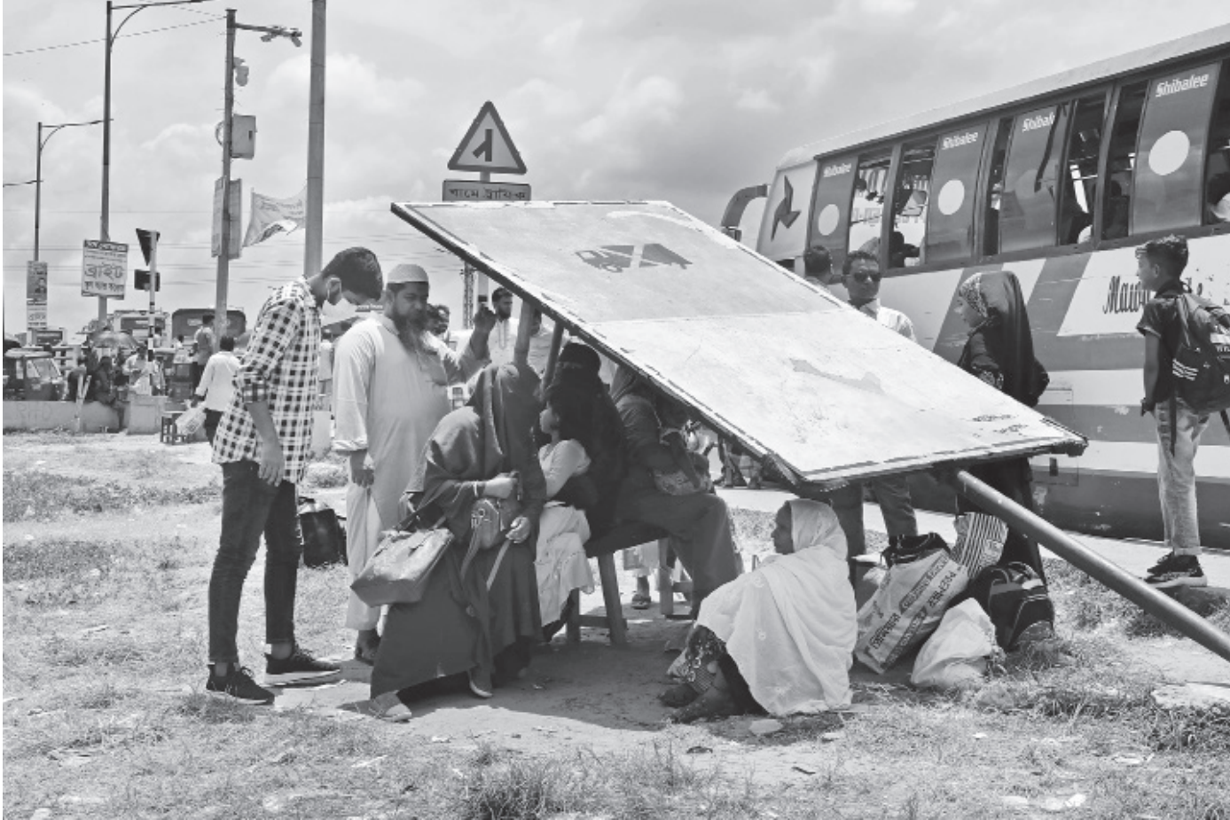
This spot near Postogola Bridge is not supposed to be used as a bus stop. However, this rule is not followed by most buses travelling on the route. Passengers are often seen waiting here, while they make use of the almost-collapsing signboard, which directs buses not to stop there, as a shade. This photo was taken yesterday.

BNP leaders also saw such dreams over past events in Egypt, he added.