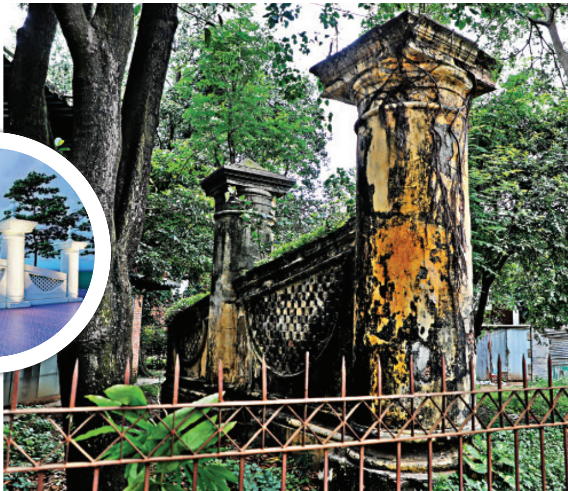
This is the current state of Dhaka Gate, uncared for and surrounded by weeds. If all goes according to plan, however, the structure will take on a new look, as seen in the proposed design.