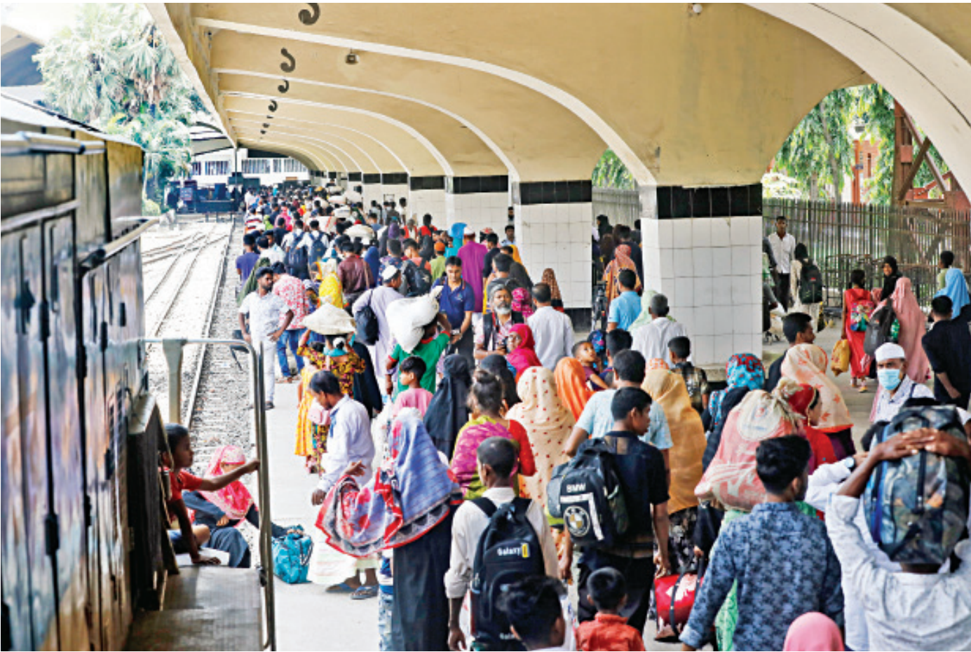
VACATION ENDS... Passengers walking towards the exit on a platform of the Kamalapur Railway Station in the capital around noon yesterday. They were returning from Jamalpur after spending the Eid holidays there.