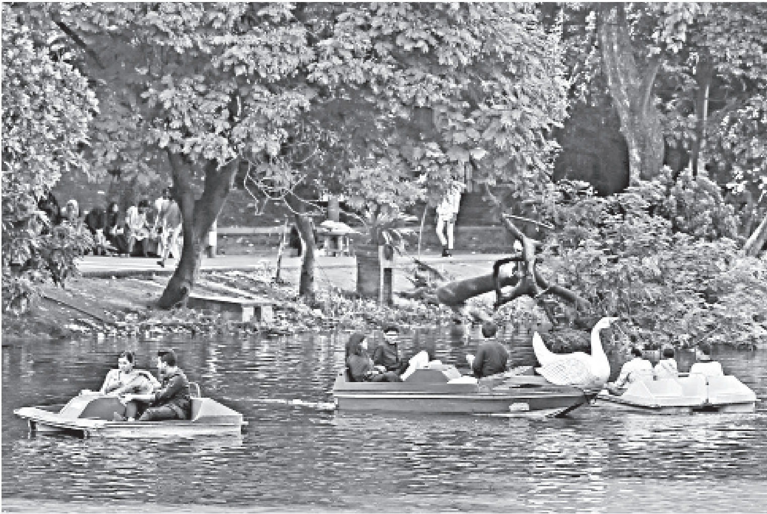
Eid is over but the festive mood persists for a few more days. Residents of the capital were seen having a good time with their close ones right after the Eid holidays at Dhanmondi Lake yesterday.

Another person was injured in the accident, which took place around 10:30pm in Tora area of Ghior upazila, said OC Riazuddin Ahmed Biplob of Ghior Police Station. After the accident, agitating locals stopped the bus and set it on fire.