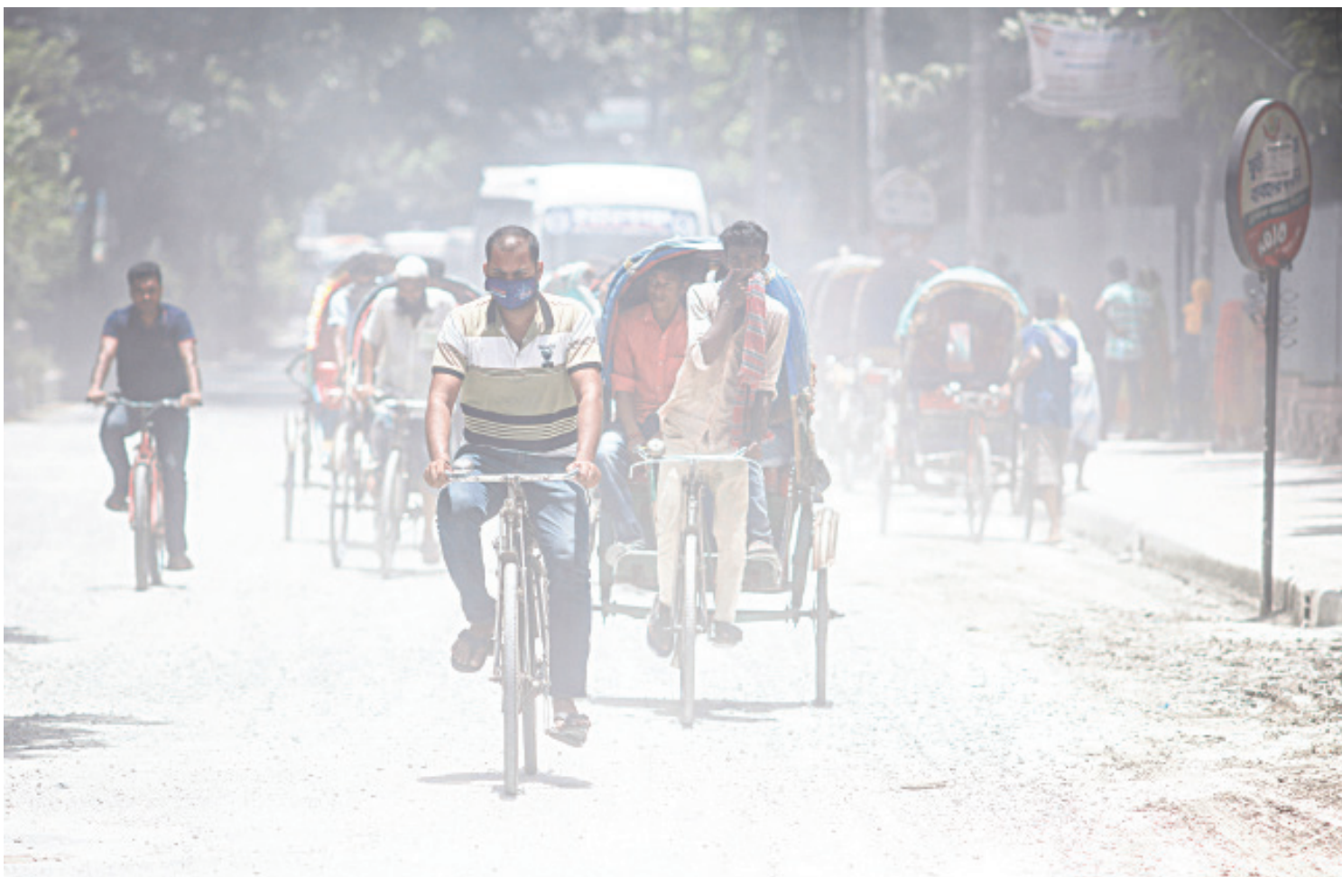
Due to indiscriminate dumping of construction materials on the road, this entire area in front of Shahbagh's Aziz Super Market was covered with dust yesterday. Contributing to the ever-existing air pollution in the capital, the dust created serious inconvenience for pedestrians and patients commuting to adjacent hospitals.