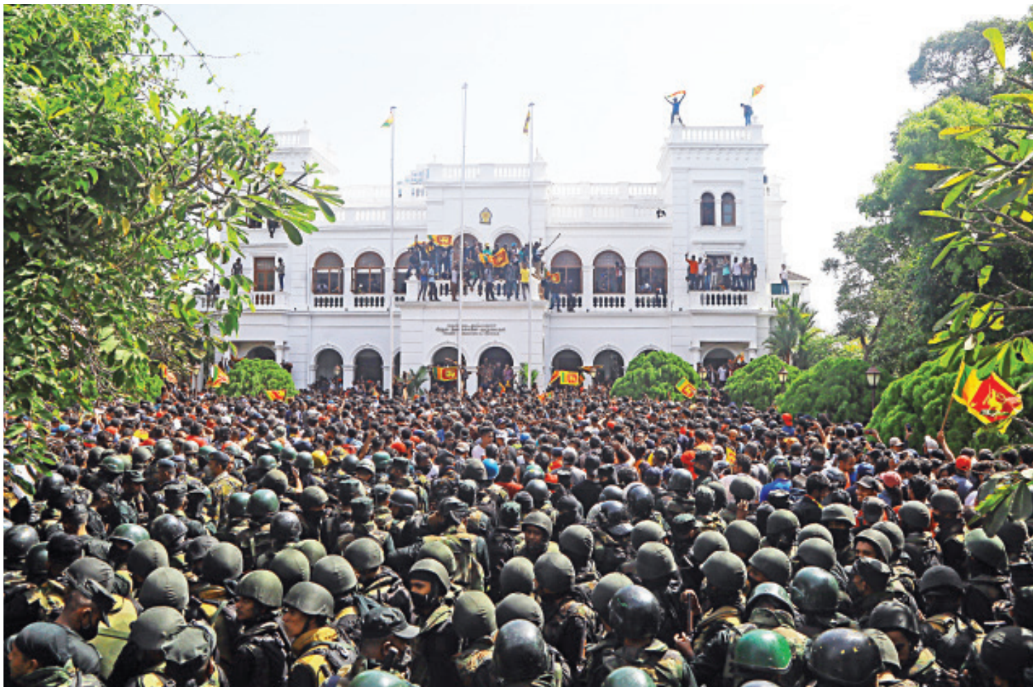
Protesters wave Sri Lankan flags after storming the office of Prime Minister Ranil Wickremesinghe in Colombo yesterday. Barely hours after President Gotabaya Rajapaksa fled the country, thousands of people yesterday clashed with security forces, demanding the resignation of the prime minister, who was appointed as the interim president.