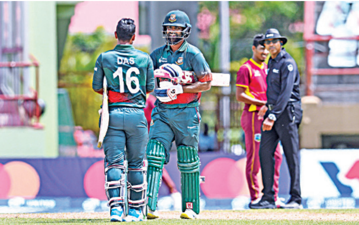
Tamim Iqbal wears a broad smile as he celebrates with Liton Das after his side's nine-wicket victory over the West Indies in the second ODI at the Guyana National Stadium in Providence on Wednesday. The Bangladesh skipper scored an unbeaten 50 – his 53rd in the format – as the visitors chased down 109 with 29.2 overs to spare to register a series victory and a 10th win on the trot over the hosts.

"Both of us had a conversation and decided we should go a little fuller and try to bowl a Test-match length," said Bumrah. "I try to keep a balanced mind, not look too far ahead... Keeping things simple, not trying to over-complicate it too much and shutting out the outside noise has always worked for me." He started England's collapse by inducing Jason Roy to play on with just his fourth ball -- one of four ducks in an England innings where Bumrah had Joe Root, the world's top-ranked Test batsman, caught behind for nought as well. "There's no doubt about the quality of the England side," said Bumrah. "You always want to test yourself against very good players." England captain Jos Buttler, whose 30 was the hosts' top score, paid tribute to Bumrah's "unique action". "He has an incredibly high level of skill -- he creates an angle but still has a phenomenal wrist to move the ball both ways from that angle to both right and left-handers," Buttler said. "He produces tough angles and does it at high pace -- as a package that is very good." Buttler has now lost three of his four games -- including a 2-1 T20 series defeat by India last week -- since taking over following former white-ball captain Eoin Morgan's retirement. "It's certainly key not to panic," Buttler said. "If I look back over the past five or six years, batting has been our super strength in this form of the game."