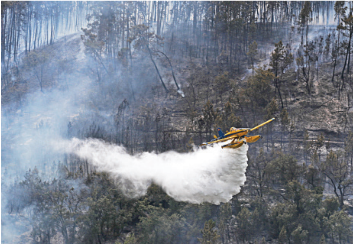
An Air Tractor AT-802F “Fire Boss” airplane takes part in firefighting operations at Espite in Ourem, Portugal, yesterday. France and Britain suffered soaring temperatures, edging closer to the blistering heat already engulfing Spain and Portugal as wildfires destroyed vast stretches of Western European forestland.