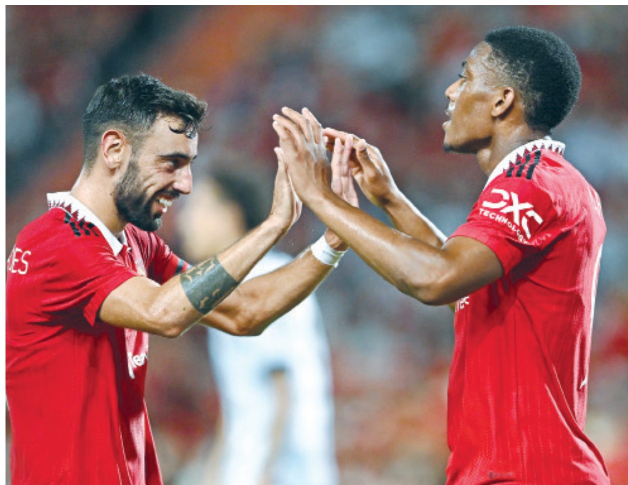
Manchester United striker Anthony Martial celebrates his goal with Bruno Fernandes during his side's 4-0 win in a friendly match against Liverpool at the Rajamangala National Stadium in Bangkok yesterday. Tens of thousands of jersey-wearing fans surged into the stadium to witness pre-season clash of the Premier League titans.

"Changing (United) coach every year is hard - this was a difficult aspect for me. Then there were a few injuries, but I think it was also a mental thing - playing and not playing makes you lose pace. There is a bit of everything: coach, team, position. All this has blocked me a bit."