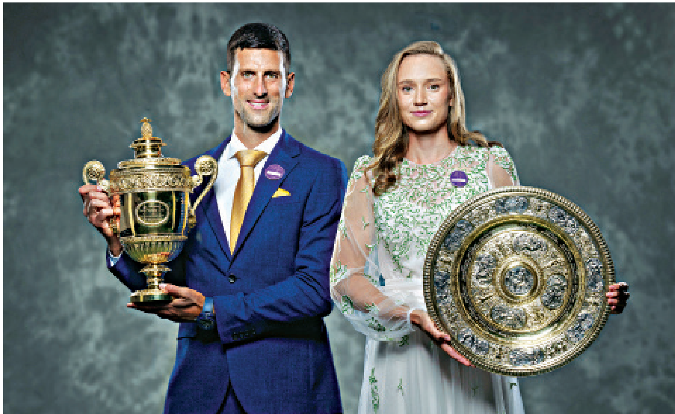
Novak Djokovic and Elena Rybakina hold their trophies at the Wimbledon champions dinner on Monday. Djokovic won a seventh Wimbledon title and 21st Grand Slam crown on Sunday with a four-set triumph over Nick Kyrgios while Rybakina powered back from a set down against Ons Jabeur to win her maiden Grand Slam title on Saturday.

"I always feel the support of our compatriots. Yesterday, upon arrival in Kazakhstan, I saw how many people came to meet me. I still can't believe what's happening," Rybakina said during a meeting with Kazakh Prime Minister Alikhan Smailov on Tuesday.