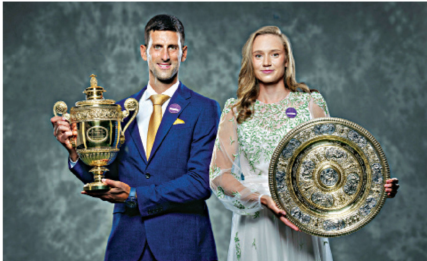
Novak Djokovic and Elena Rybakina hold their trophies at the Wimbledon champions dinner on Monday. Djokovic won a seventh Wimbledon title and 21st Grand Slam crown on Sunday with a four-set triumph over Nick Kyrgios while Rybakina powered back from a set down against Ons Jabeur to win her maiden Grand Slam title on Saturday.

"I always feel the support of our compatriots. Yesterday, upon arrival in Kazakhstan, I saw how many people came to meet me. I still can't believe what's happening," Rybakina said during a meeting with Kazakh Prime Minister Alikhan Smailov on Tuesday.