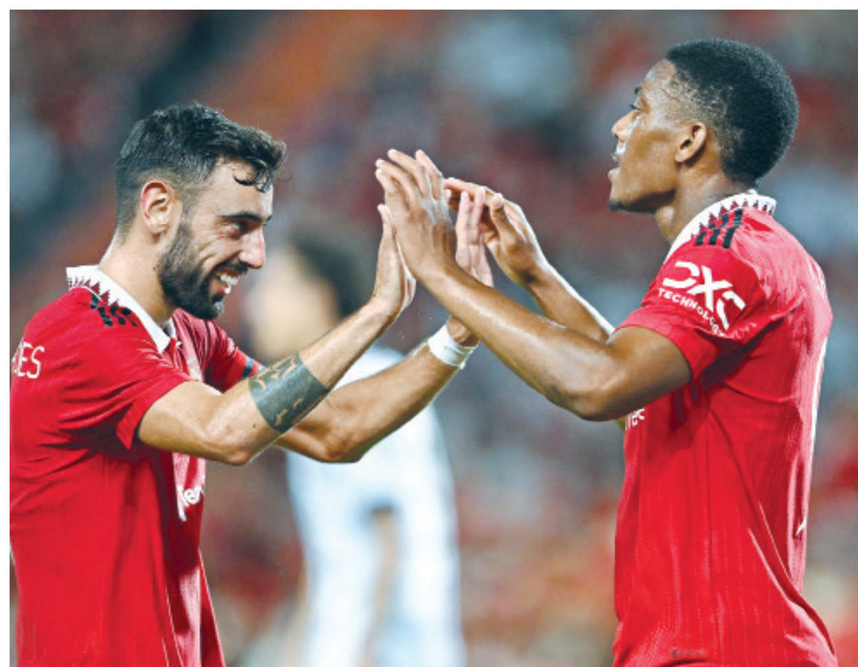
Manchester United striker Anthony Martial celebrates his goal with Bruno Fernandes during his side's 4-0 win in a friendly match against Liverpool at the Rajamangala National Stadium in Bangkok yesterday. Tens of thousands of jersey-wearing fans surged into the stadium to witness pre-season clash of the Premier League titans.

"Changing (United) coach every year is hard - this was a difficult aspect for me. Then there were a few injuries, but I think it was also a mental thing - playing and not playing makes you lose pace. There is a bit of everything: coach, team, position. All this has blocked me a bit."