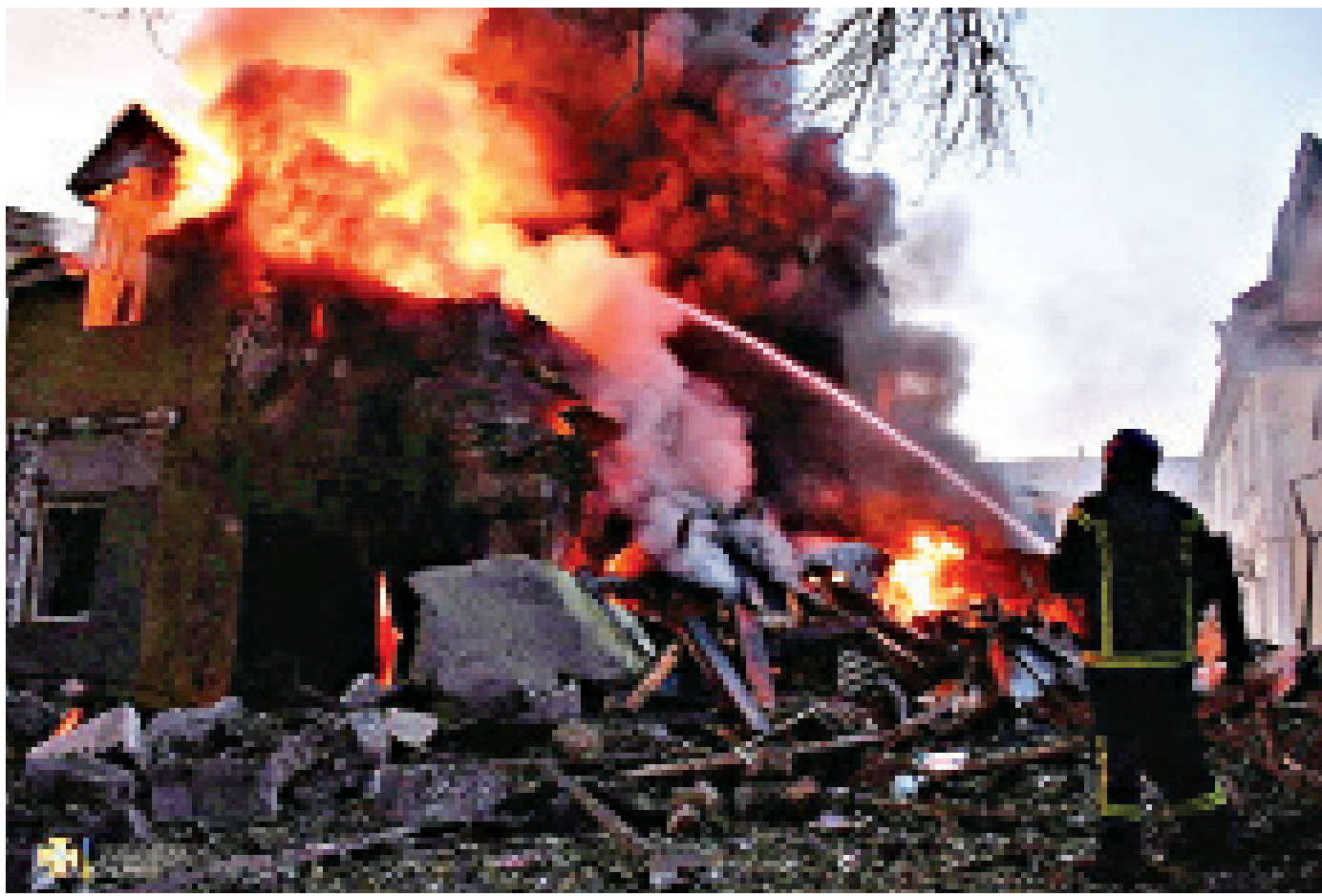
A firefighter works at a site of a residential building damaged by a Russian military strike, as Russia's attack on Ukraine continues, in Mykolaiv, Ukraine yesterday.

During his studentship at Dhaka University, he was the founding editor of literature magazine "Uttaran".