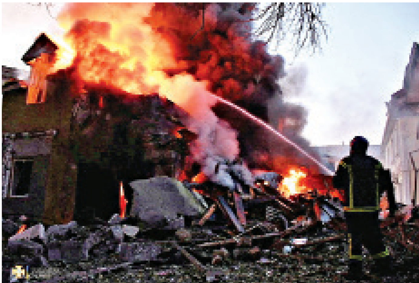
A firefighter works at a site of a residential building damaged by a Russian military strike, as Russia's attack on Ukraine continues, in Mykolaiv, Ukraine yesterday.

During his studentship at Dhaka University, he was the founding editor of literature magazine "Uttaran".