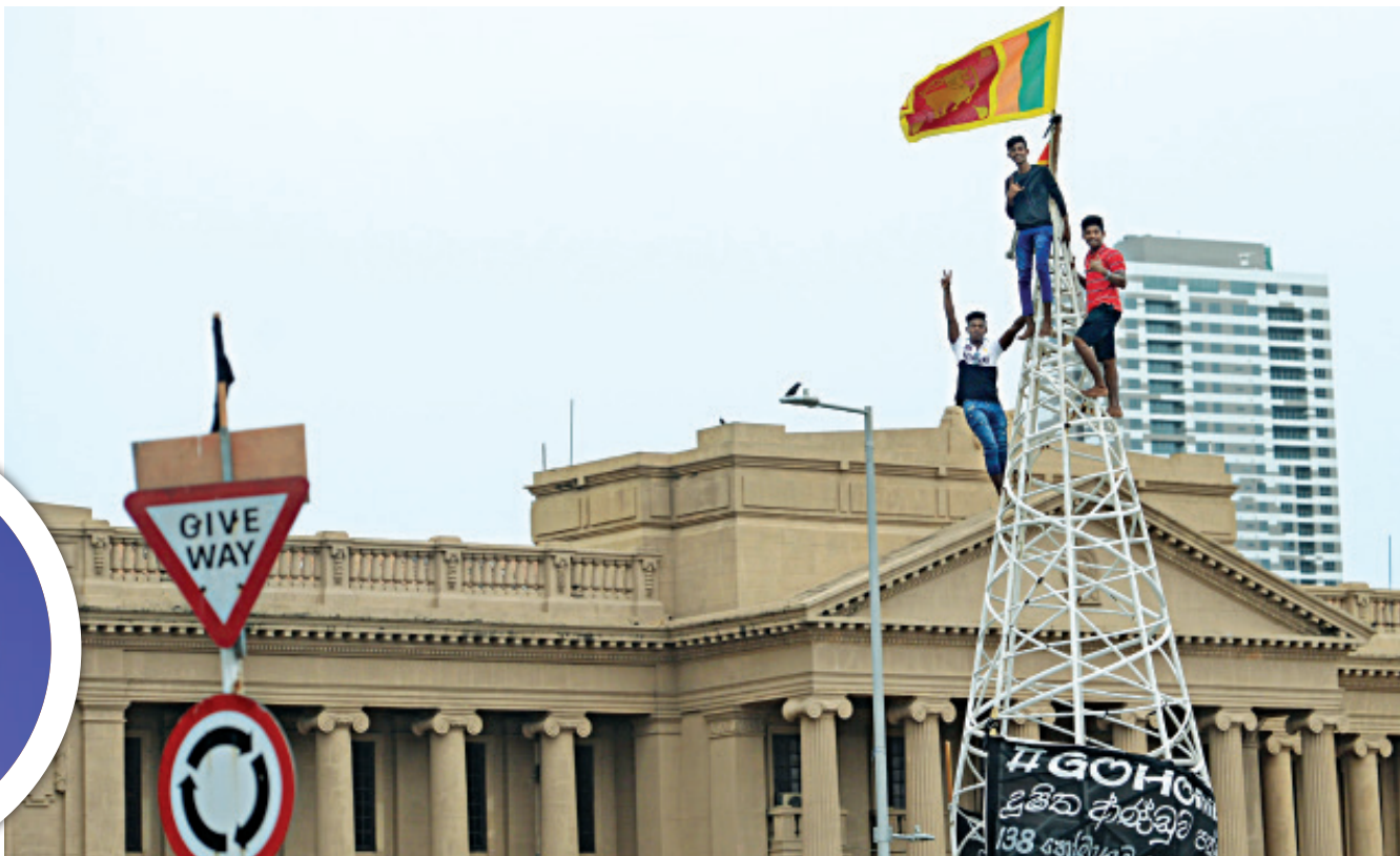
A man waves Sri Lanka's national flag after climbing a tower near the presidential secretariat in Colombo yesterday after it was overrun by anti-government protesters.