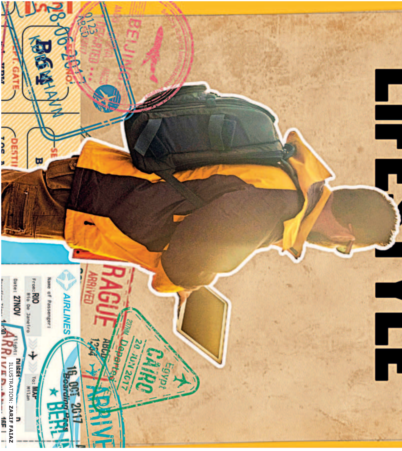
ILLUSTRATION: ZARIF FAIAZ

Eid Festival GRAB THE CHANCE TO GET up to 20 LAGTAKA OR PRODUCTS WORTH OF CRORES TAKA FREE Digital Campaign 2022 Season-15