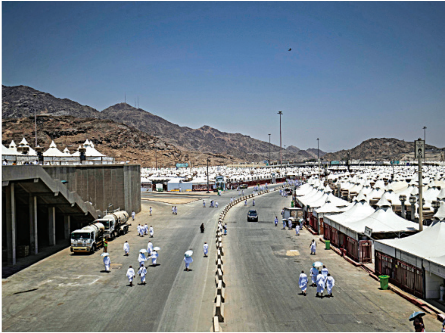
Pilgrims arrive in Mina near the Saudi holy city of Makkah during the annual hajj pilgrimage yesterday. Worshippers will ascend Mount Arafat today for the climax of the annual hajj which brings together one million people from around the world.