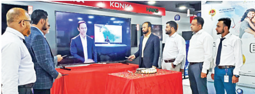
Officials of Electro Mart are seen showcasing the features of a new line of Konka android voice-control televisions at the group's corporate office in Gulshan, Dhaka.

"If they are critical, great. This means they are comfortable to say what they think."