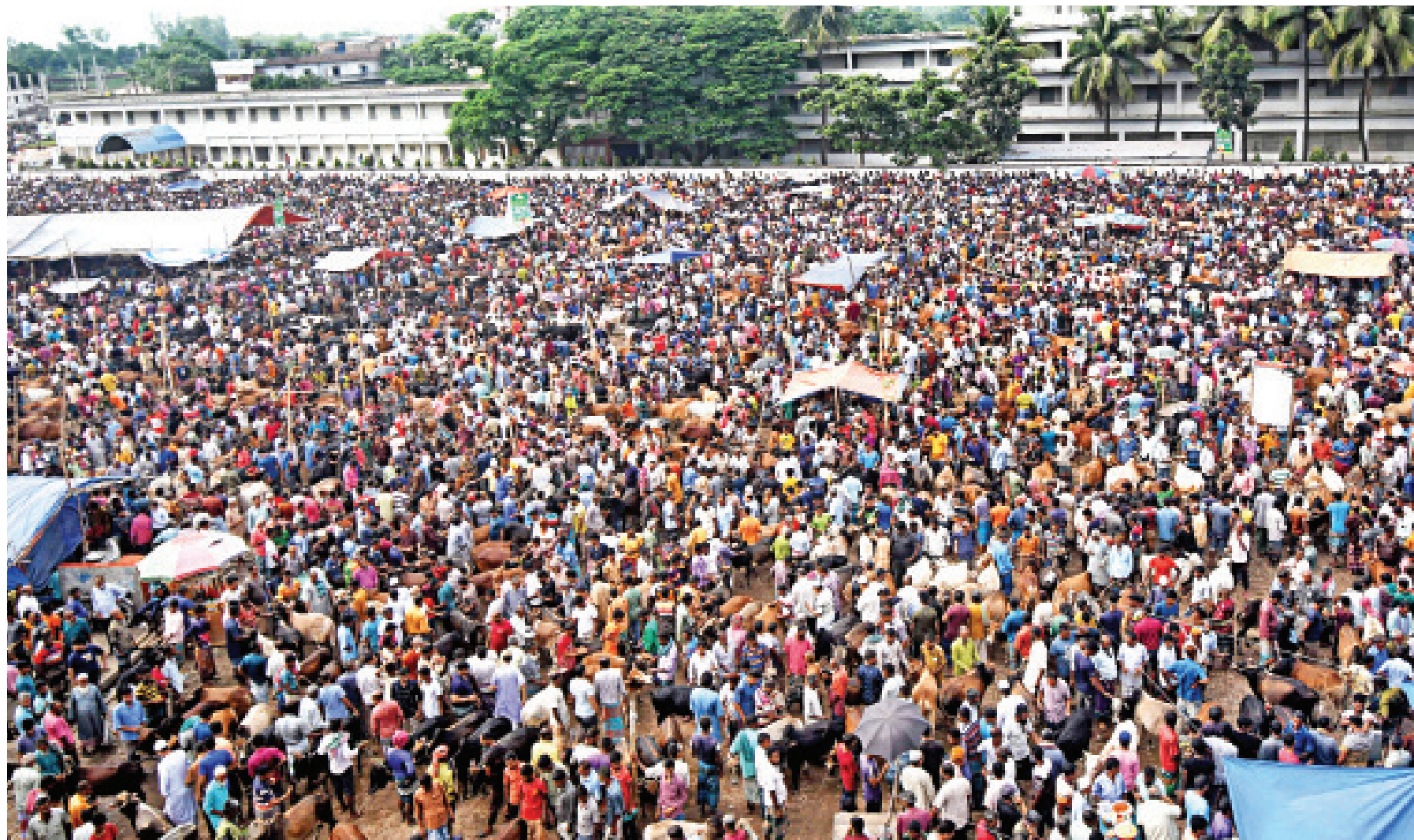
The weekly Mohasthan Haat cattle market in Bogura's Shibganj upazila is bustling with people as the sale of sacrificial animals has picked up ahead of Eid-ul-Azha. Medium-sized bulls, which were sold for Tk 60,000 to Tk 80,000 each, were in high demand. The photo was taken yesterday.