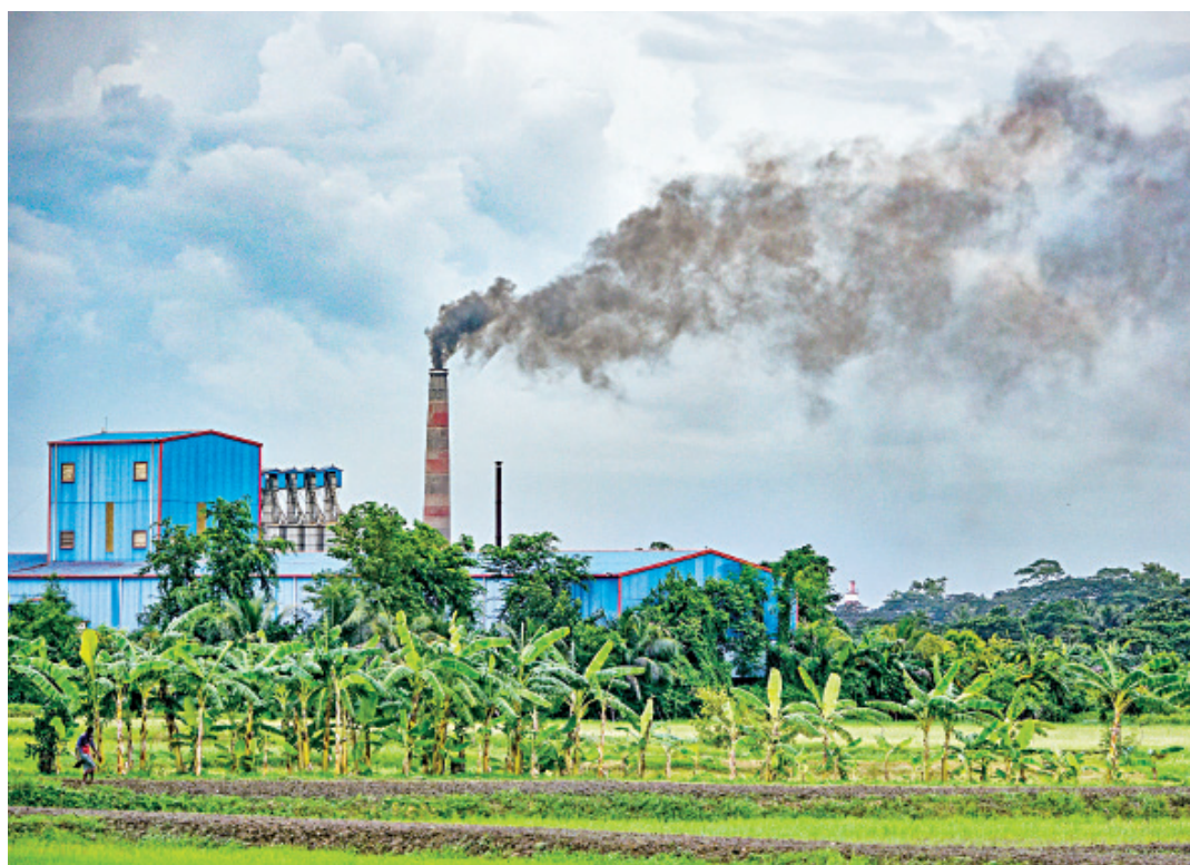
Black fumes billowing out the chimney of an auto rice mill pollute the air in Jabusa Chourasta area of Khulna's Rupsha upazila yesterday.