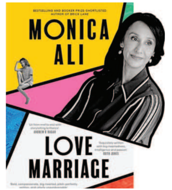
DESIGN: KAZI AKIB BIN ASAD