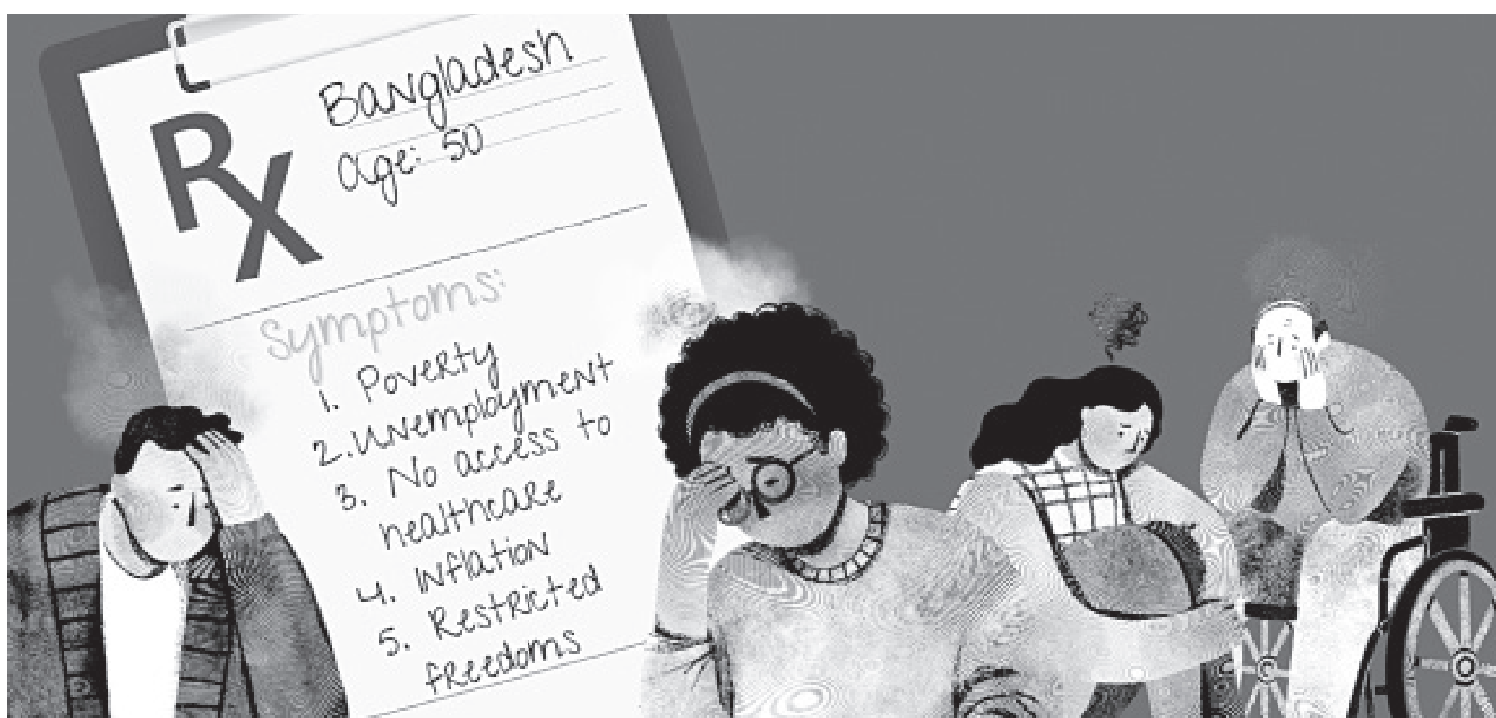
ILLUSTRATION: TEENI AND TUNI

In the months after Hafiz's death, there were talks of bringing university students under mandatory dope tests; last month, Home Minister Asaduzzaman Khan Kamal announced that dope tests will be made compulsory for students during