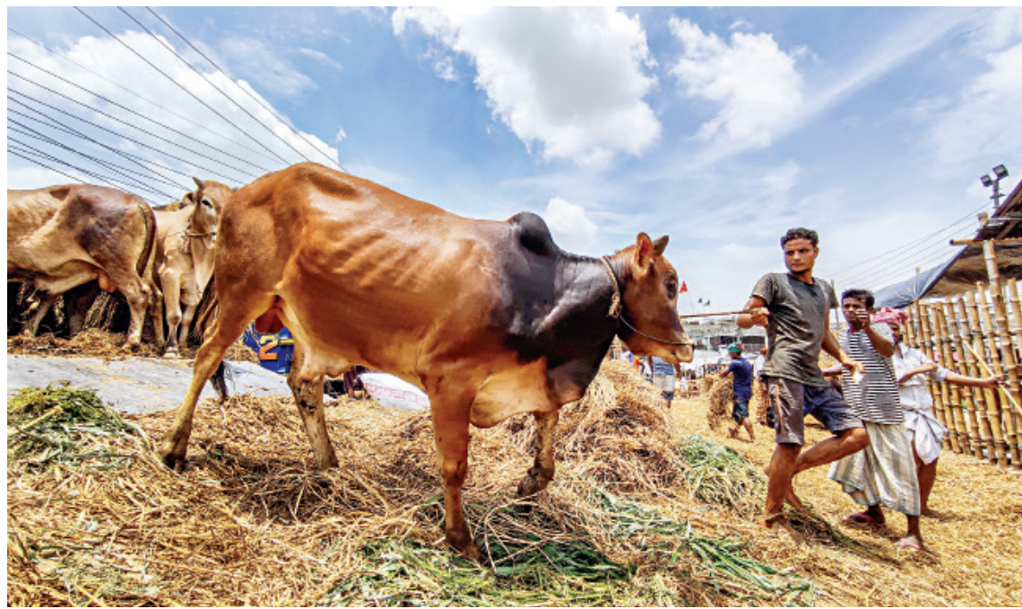
Although traders are poised to sell the animals they brought to the cattle markets this year, customers are still sparse. Traders are hoping that sales will pick up right before Eid. This photo was taken recently from Gabtoli cattle market.