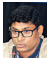
Shamim Haider Patwary , Member of Parliament

The case proceedings should be digitised and made accessible online.