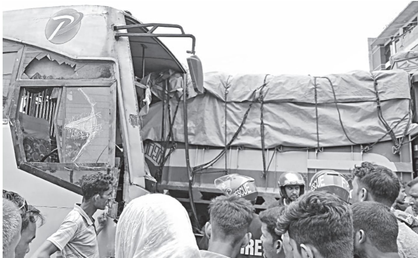
At least one person was killed and 12 were injured in a collision between a bus and truck on Bogura-Natore regional highway in Shakpala area of Shahjahanpur upazila yesterday morning.