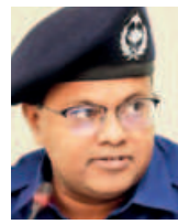
Mohd. Mahfuzur Rahman Al-Mamun , REC PI, AIG, Bangladesh Police

We are already piloting an online GD filing system in six districts, which will soon be available all over Bangladesh. Bangladesh police have created a database where the criminal record of a particular person can be found easily. This database, along with the online GD and FIR filing system, should be connected to the My Court app.