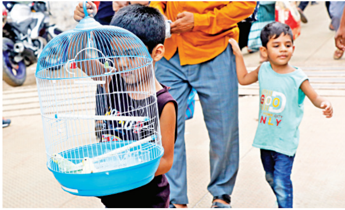
Little Rubab was spotted heading home with his family members for Eid vacation at Sadarghat yesterday. This eight-year-old refused to leave behind his pet birds. After all, they are family as well, and who leaves the family behind on occasions that are supposed to reunite families?

It also must be seen whether children have the scope for extra-curricular activities and whether our education system can instill moral values.