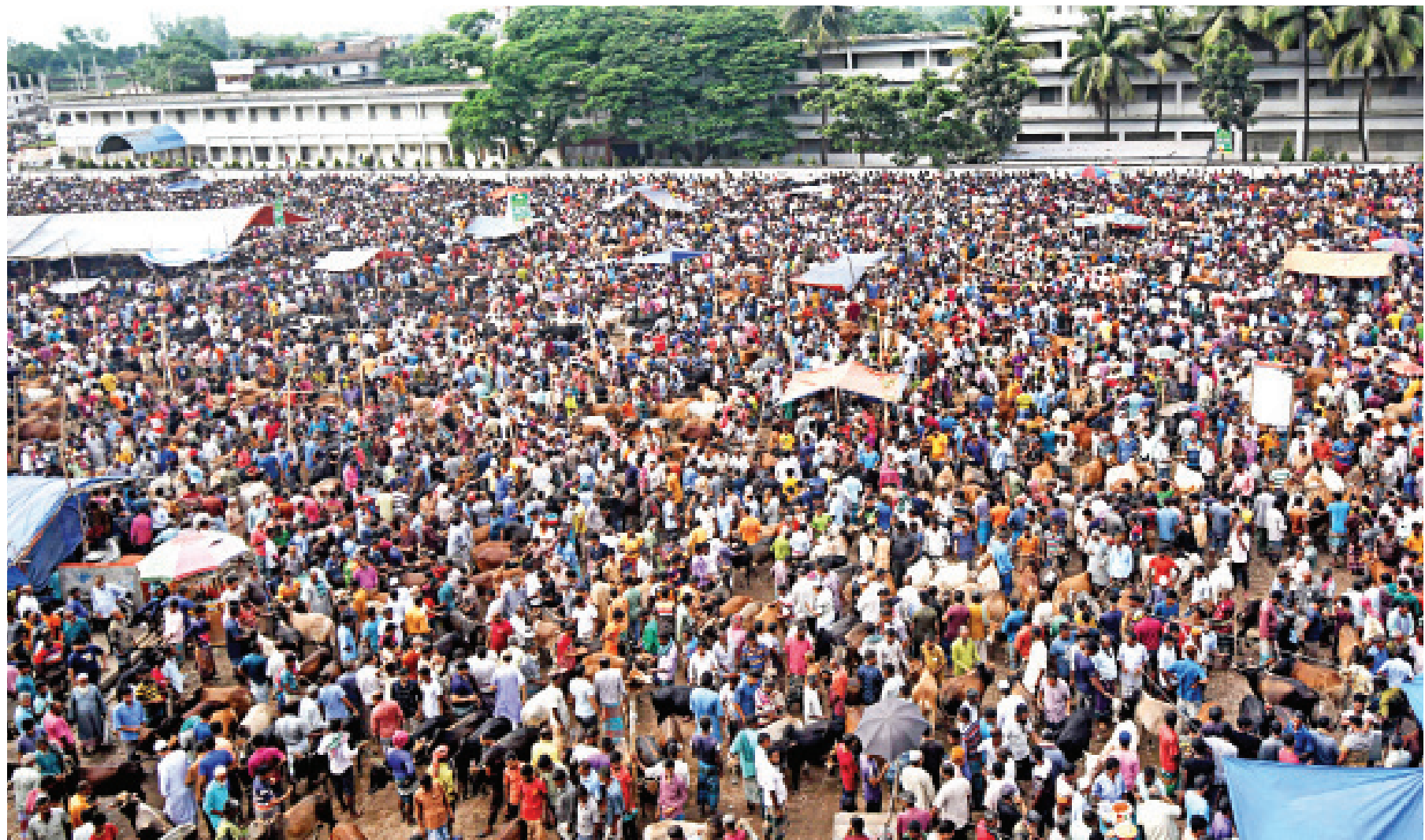
The weekly Mohasthan Haat cattle market in Bogura's Shibganj upazila is bustling with people as the sale of sacrificial animals has picked up ahead of Eid-ul-Azha. Medium-sized bulls, which were sold for Tk 60,000 to Tk 80,000 each, were in high demand. The photo was taken yesterday.