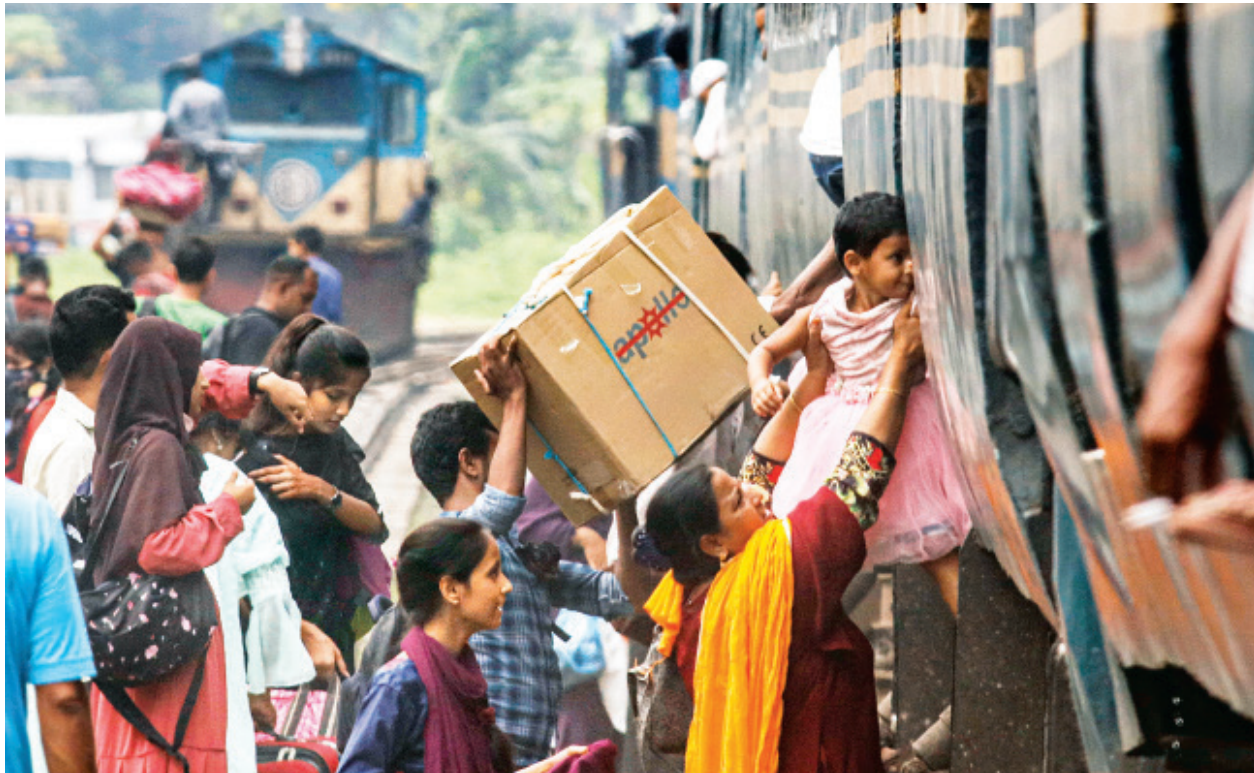
A woman helping a child into the train from ground level. With a platform of the Kamalapur Railway Station overcrowded with holidaymakers heading home for Eid, some passengers got down from the opposite platform and crossed the rail lines to board the Jamalpur-bound train. The photo was taken around 2:20pm yesterday.