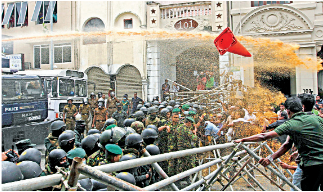
Police use water canon to disperse farmers taking part in an anti-government protest demanding the resignation of Sri Lanka's President Gotabaya Rajapaksa over the country's ongoing economic crisis in Colombo yesterday. Sri Lanka has asked Russia to provide fuel and resume tourist flights to help the country weather its economic crisis, President Gotabaya Rajapaksa said.