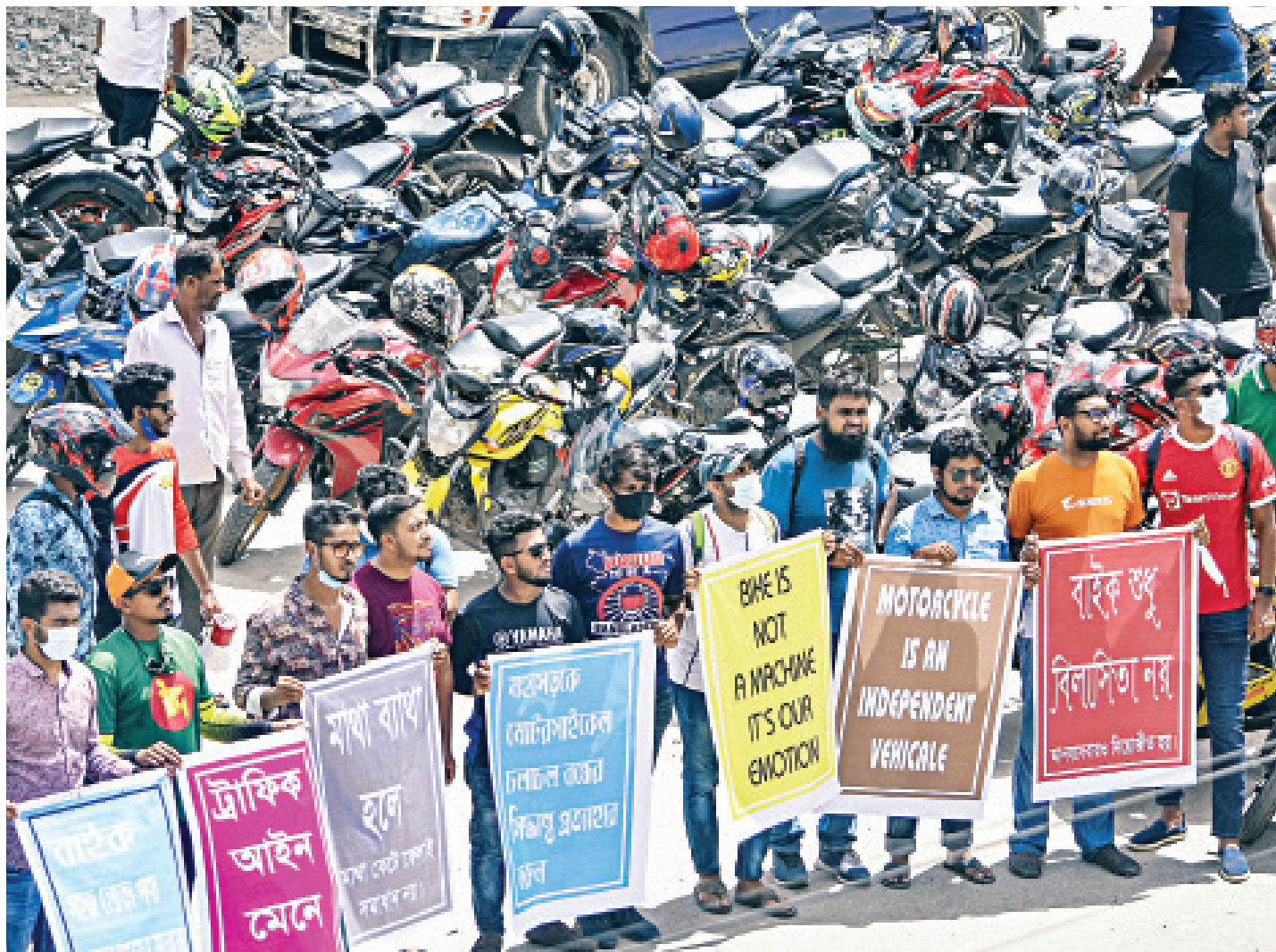
Motorcyclists in Khulna protesting the government's decision of banning motorcycles on highways during the Eid-ul-Azha holidays. They submitted a memorandum to the deputy commissioner yesterday after the protest.