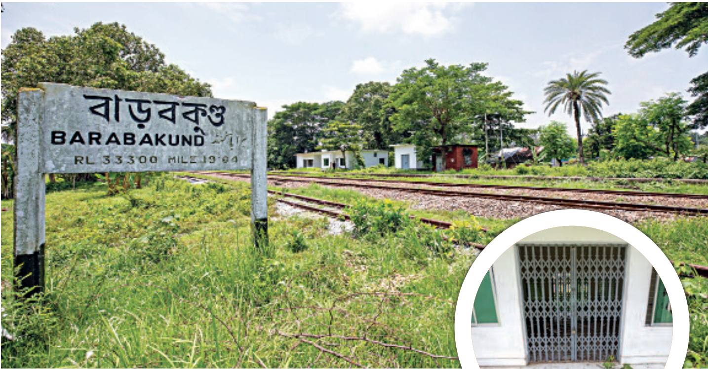
The century-old Barabakunda station in Chattogram was closed down in 2009, due to a station-master crisis, and now, the building remains deserted. Forty-six stations in Bangladesh Railway's east zone have met the same fate, all because there aren't enough staffers to keep them operational.