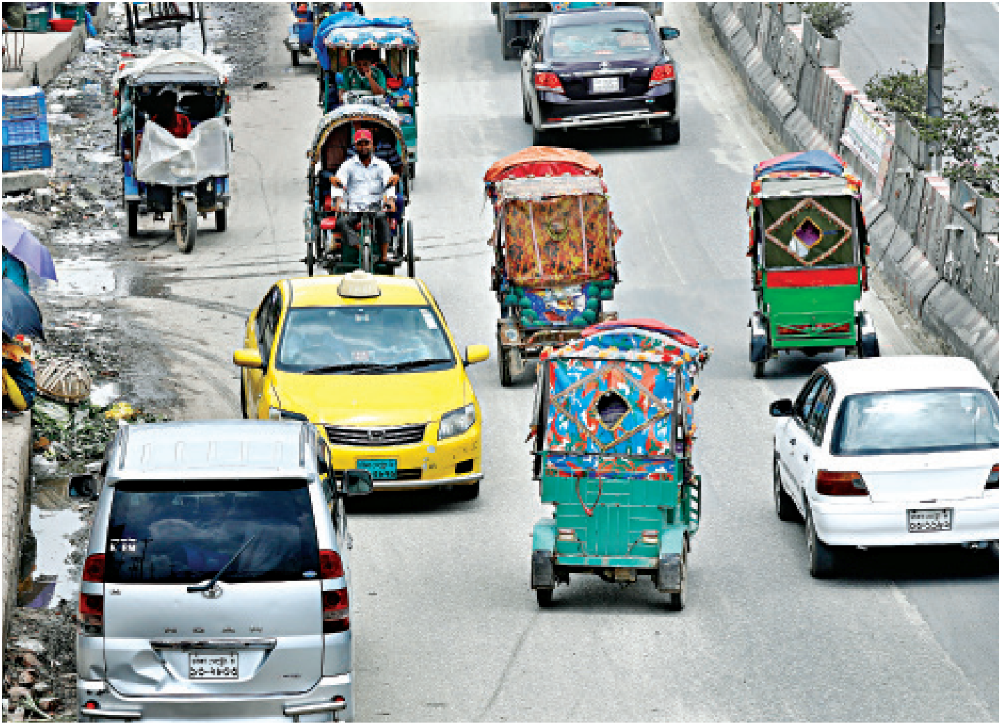
At least three battery-powered auto-rickshaws run against traffic on the Dhaka-Aricha Highway near Savar's Hemayetpur. Vehicles on the wrong way, a deliberate traffic violation, is one of the major causes of road accidents across the country. The photo was taken yesterday.