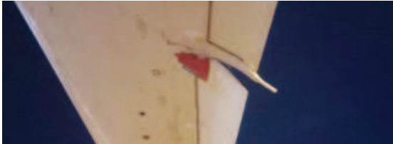
The damage done to the Boeing-787