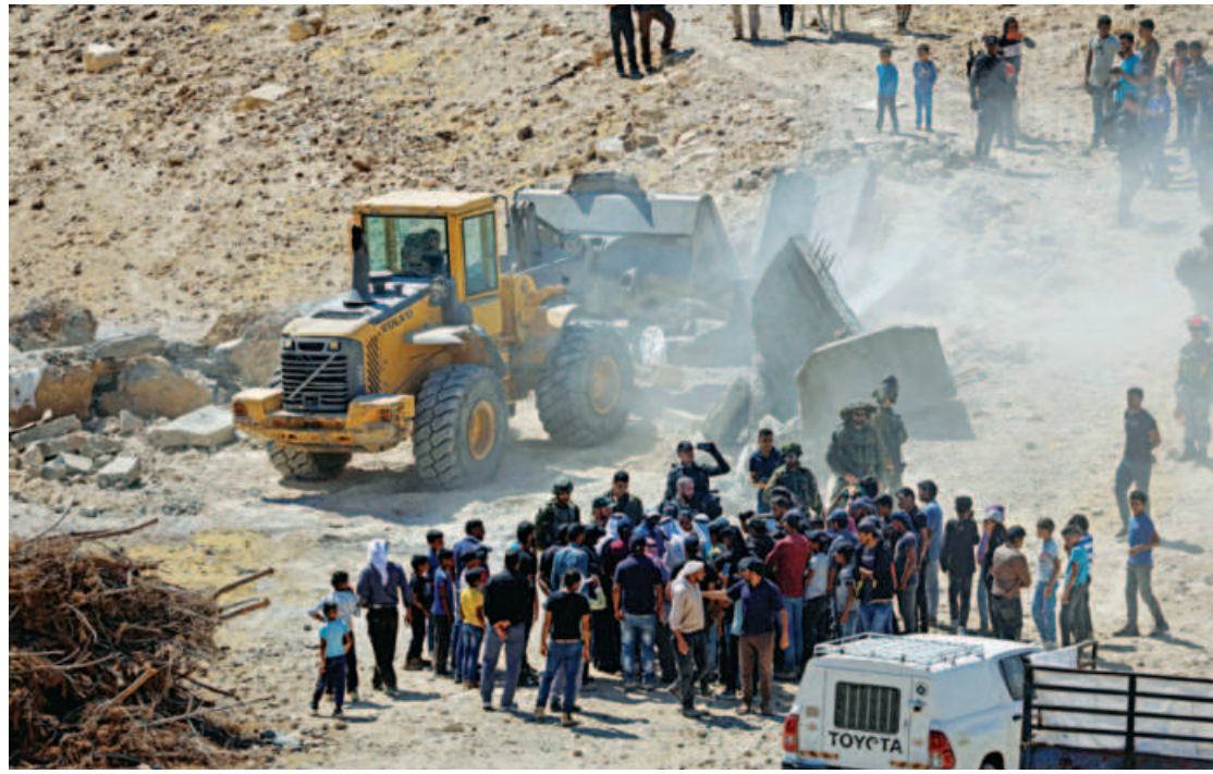
People gather as an Israeli machinery guarded by Israeli forces demolish a Palestinian house in Masafer Yatta, in the Israeli-occupied West Bank yesterday.

The US Security Coordinator (USSC), after summarizing investigations by both the Israel Defense Forces (IDF) and the Palestinian Authority, concluded that gunfire from Israeli positions was likely to have been responsible for her death, the State Department said.