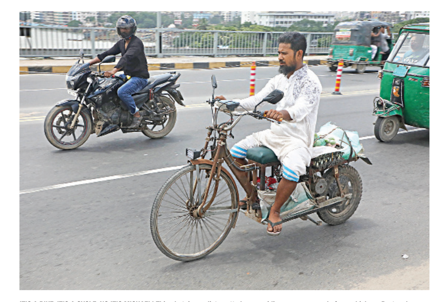
IT'S A BIKE, IT'S A CYCLE, NO IT'S MICHAEL! This photojournalist spotted a man riding a never-seen-before vehicle on Postogola bridge, going towards Keraniganj recently. The owner of the vehicle calls it a "Michael" -- a two-wheeler that has the front of a bicycle and the back of a motorbike, with a pair of looking glasses. Although the vehicle seems functional, there's a lot of doubt about its safety.