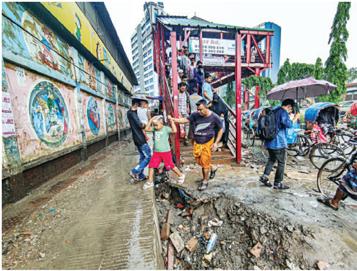
A man helps his child cross a gaping hole near Shyamoli Shishu Mela in the capital. The hole was dug up to widen a sewerage line, but the authorities concerned are yet to fill it up, exposing pedestrians to the risk of injury. The photo was taken yesterday.