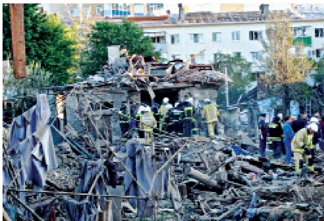
Rescuers work at the site of a destroyed residential building after missiles hit Belgorod, Russia, yesterday. At least four people were killed in the Russian city of Belgorod near the Ukraine border, the regional governor said, in what Moscow said was a Ukrainian missile attack.