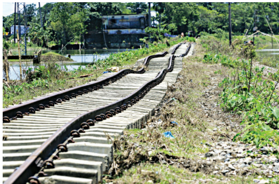
With floodwaters receding in many areas in Sylhet division, a trail of devastation is becoming visible. These rail lines in Chhatak upazila of Sunamganj, which had been under water for days, appear to be warped as the gravel underneath got washed away.