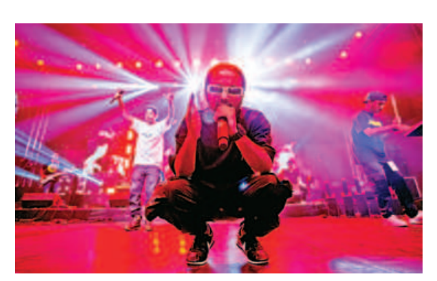
Jalali Set were their flamboyant self with their hot verses.