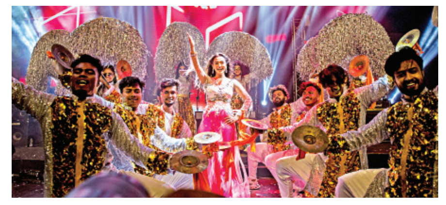
Nusraat Faria rocks the stage with her performance.