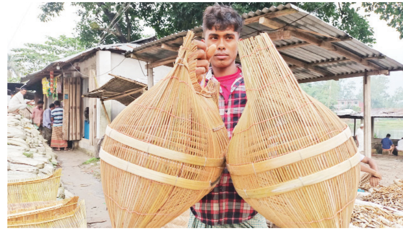
A teprai craftsman displays the fish traps at Gaglar Haat for sale in Kurigram's Nageshwari upazila.

corners. The DC added that government rent will be fixed anew through discussion with all upazila nirbahi officers. The new rate will be fixed keeping in mind that the leaseholders, buyers and sellers do not face any loss.