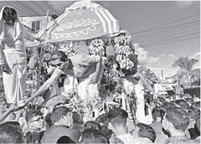
After a two-year hiatus, Ratha Yatra, the celebration of Lord Jagannath's journey to his aunt's house, was commemorated by people of the Hindu faith, with colourful processions across the country yesterday. These photos were taken from Khulna city's Dakbangla intersection and Barishal's BM College Road, inset.