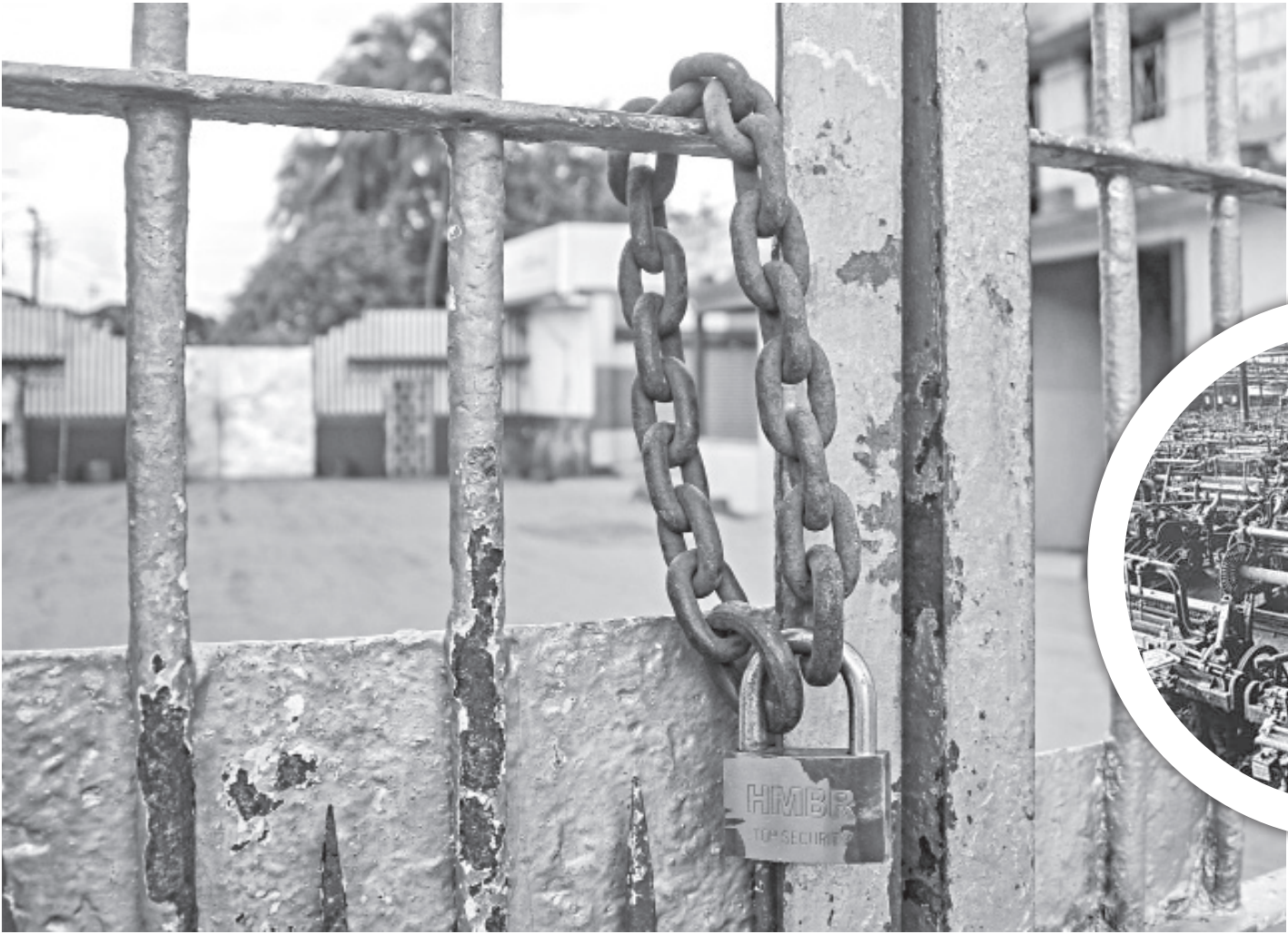
Seven state-owned jute mills have been closed for two years. The closure has made life almost unliveable for the workers who lost their jobs due to the closure.