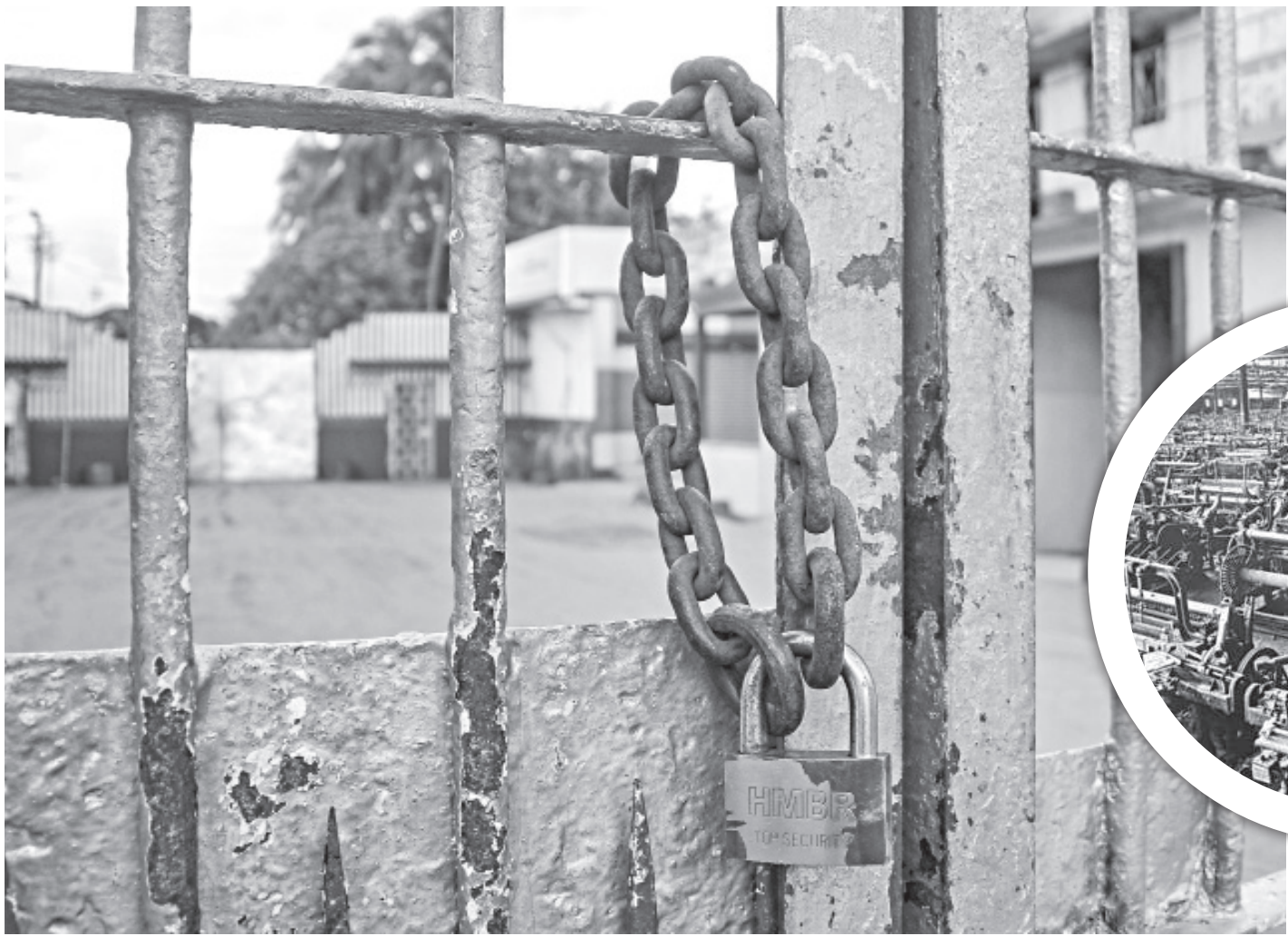
Seven state-owned jute mills have been closed for two years. The closure has made life almost unliveable for the workers who lost their jobs due to the closure.