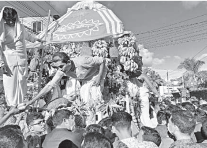
After a two-year hiatus, Ratha Yatra, the celebration of Lord Jagannath’s journey to his aunt’s house, was commemorated by people of the Hindu faith, with colourful processions across the country yesterday. These photos were taken from Khulna city’s Dakbangla intersection and Barishal’s BM College Road, inset.