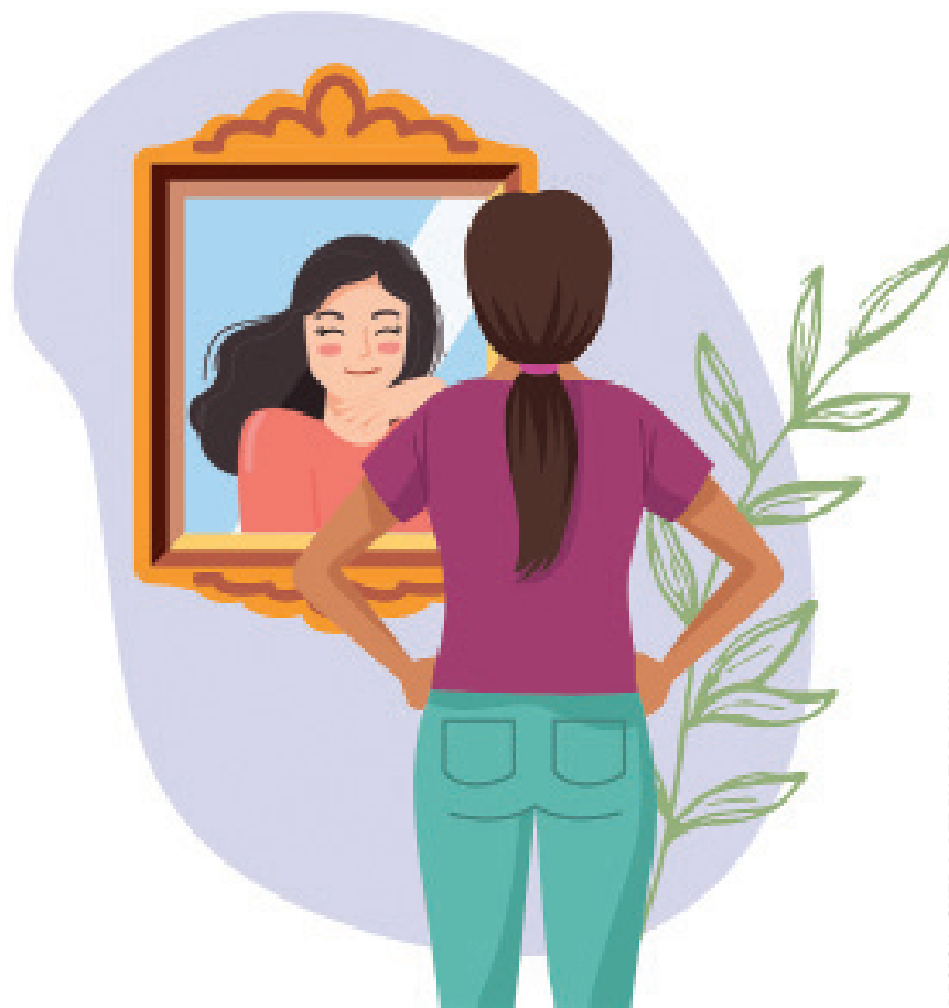
DESIGN: SYEDA AFRIN TARANNUM

If one happens to see beauty in all their flaws, great. But if one does not, they can aim to see the beauty in the functionality of their body before moving on to its appearance. After all, like most things in life, it is what is on the inside that counts the most.