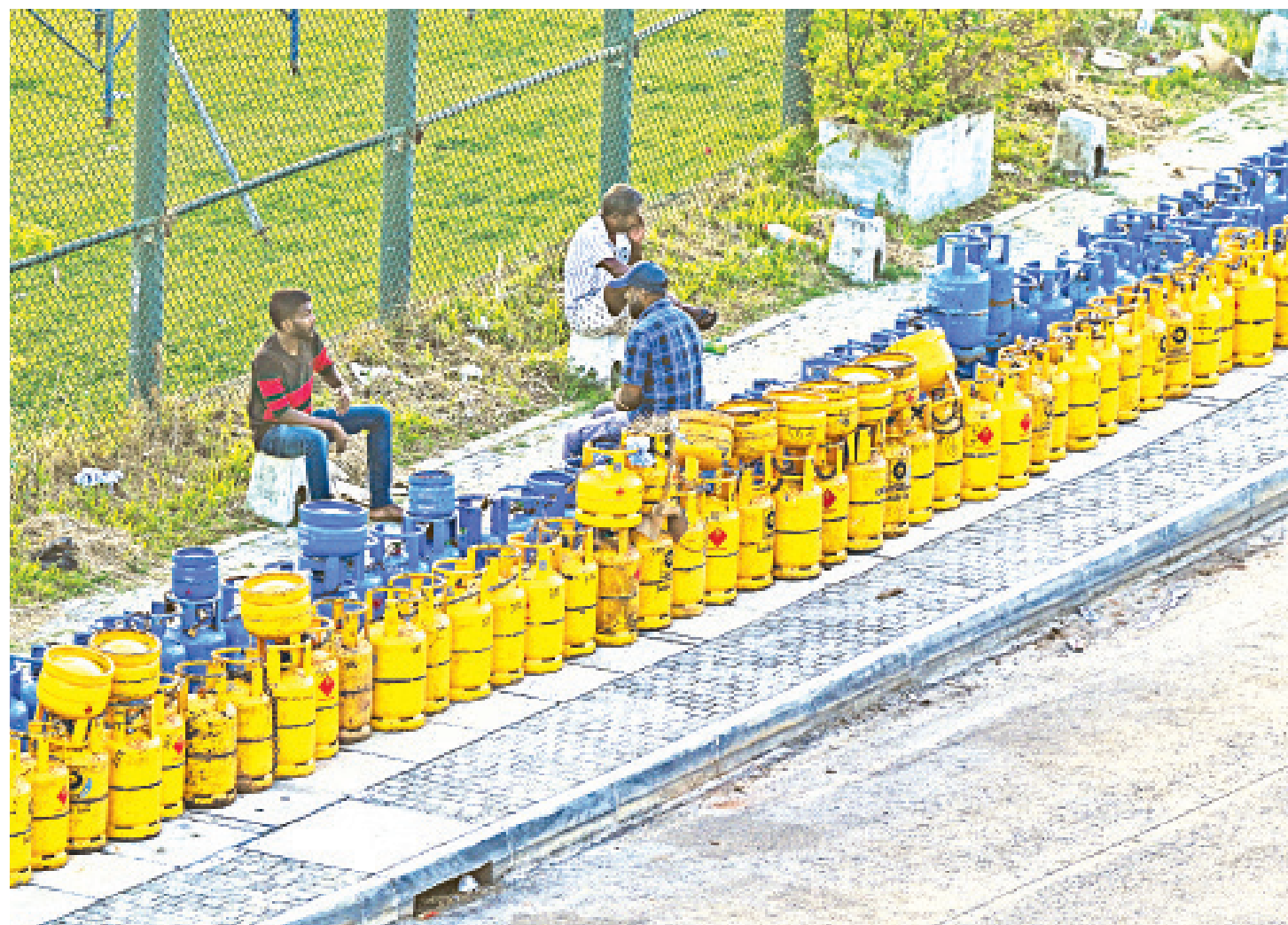
People queue along a street to buy LPG cylinders near the Galle International Cricket Stadium in Galle, Sri Lanka on Tuesday.

The sale highlights how India has maintained trade ties with Russia for commodities such as oil and coal despite the western sanctions. India has longstanding political and security ties with Russia and has refrained from condemning the attack in Ukraine, which Russia says is a "special military operation".