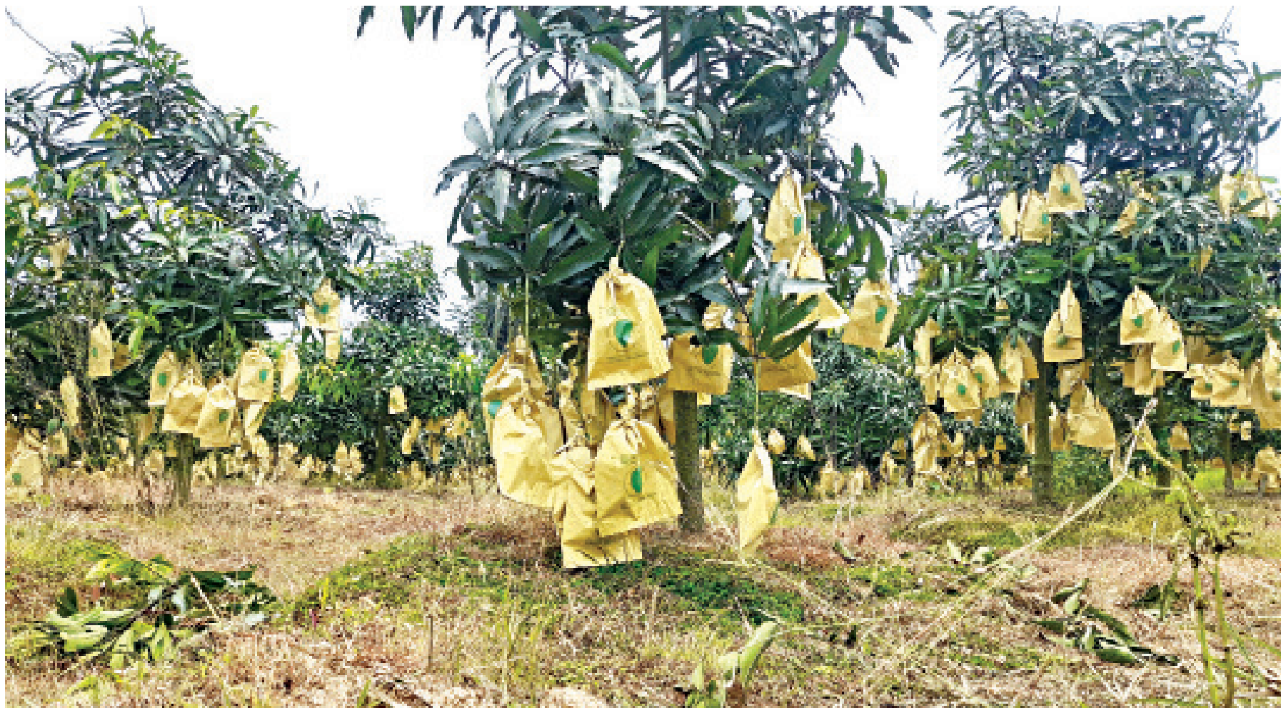
Farmers in Naogaon and Jhenaidah have started using a special growing method involving fruit bags to ensure high quality mangoes for export. However, lower yields compared to that of the 2021 season coupled with increased carrying costs could dash their hopes for higher earnings. The picture was taken from a farm in Sapahar upazila of Naogaon recently.