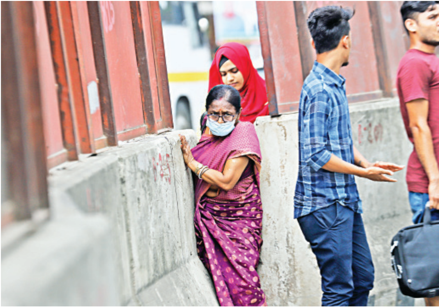
In absence of a foot-over bridge at Farmgate intersection, pedestrians squeeze through a concrete divider set in the middle of the road to go to the other side. This puts them at great risk since approaching cars often can't see them coming onto the road. This photo was taken yesterday.