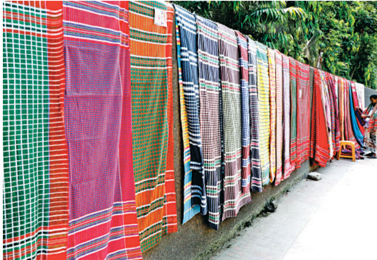
A vendor hangs gamcha (a type of fabric typically used as a towel) of different eye-catching colour combinations on a wall for sale. After purchasing them in bulk from Narsingdi, each piece goes for Tk 80-200, depending on the size. This photo was taken yesterday from the capital's Shyamoli area.