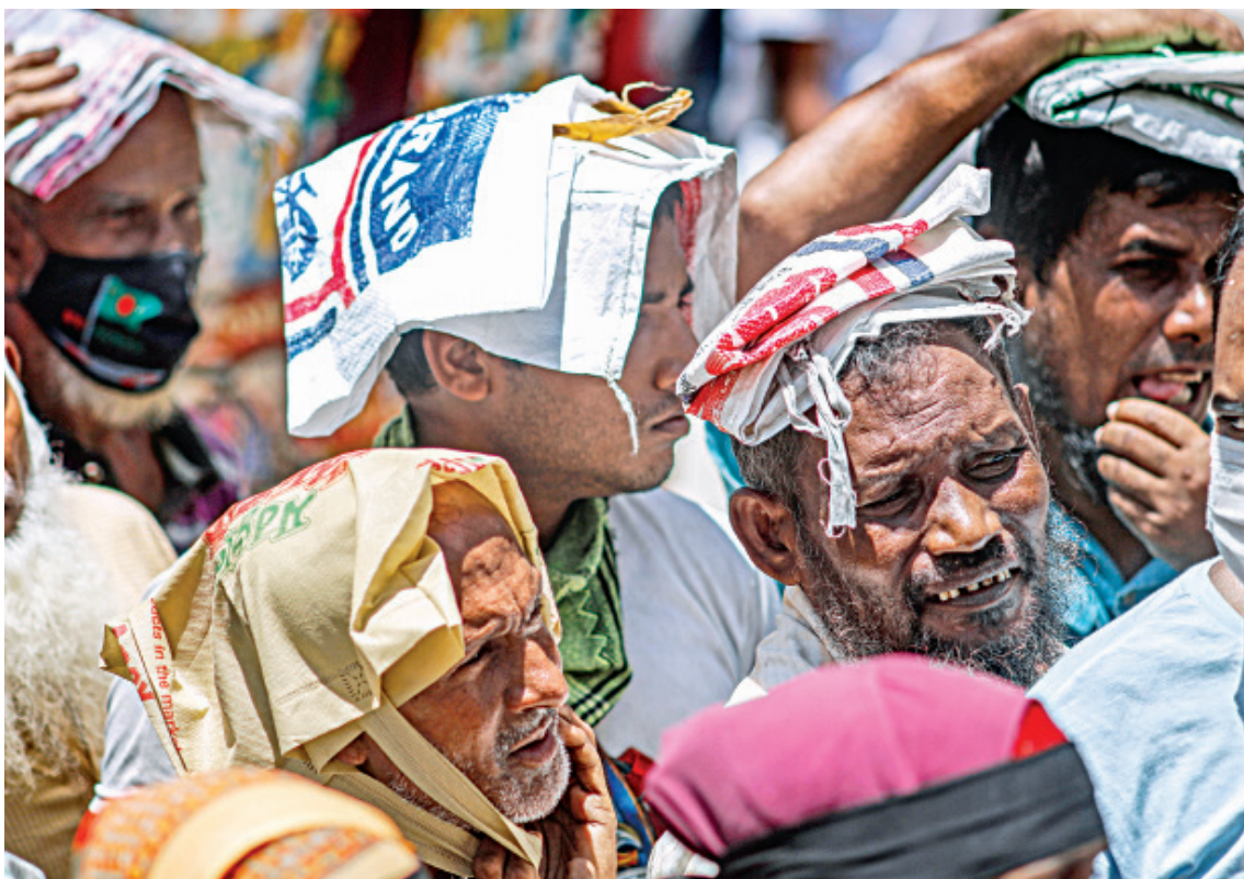
To get respite from heat, people cover their heads with shopping bags they brought with them to purchase daily essentials from an Open Market Sales (OMS) point and await their turn patiently. This photo was taken in front of Bangshal (Bangladesh Field) yesterday.