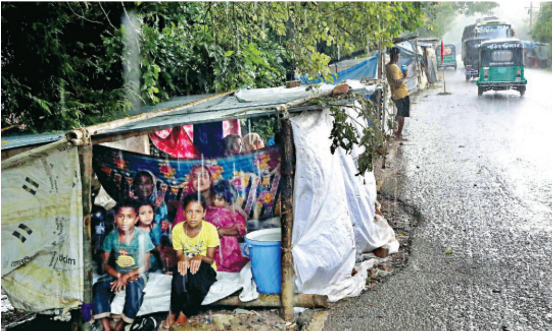
Flood victims take shelter inside a roadside shack in Ayna Bazar of Sylhet's Balaganj upazila during yet another dreary, gloomy and rainy day yesterday.