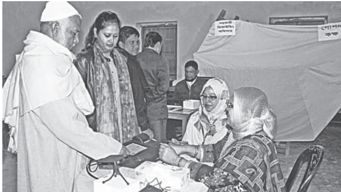
A man casts his vote through an electronic voting machine at the Begum Rokeya Government College centre during Rajshahi City Corporation polls in 2017.

is often seen as a tool for making the electoral process more efficient. Properly implemented, e-voting solutions can increase the security of the ballot, speed up the processing of results and make voting easier, and provide more accurate results as human error is excluded. The proponents of EVMs have also argued that e-voting can strengthen the credibility of