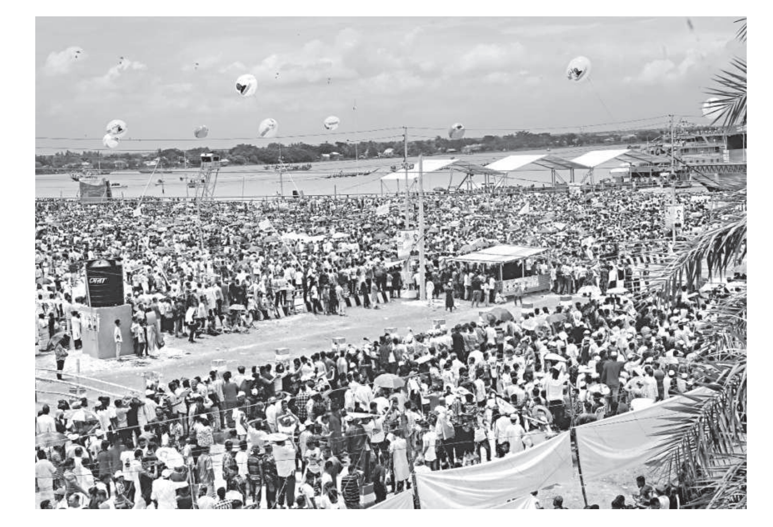
The people of Mawa in Munshiganj and Jajira in Shariatpur were in a festive mood yesterday owing to the opening ceremony of the Padma Bridge. Thousands from across the country started to throng the areas since morning to catch a glimpse of the bridge. This photo was taken from the Jajira point.

hazards. According to Department of Environment's (DoE) Brahmanbaria office, at least 17 brickfields