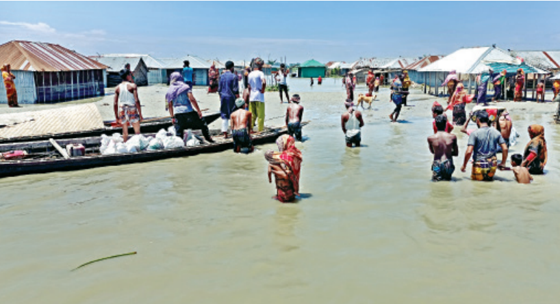
Flood-affected people of Porar Char on the Brahmaputra river in Kurigram Sadar upazila collecting relief materials sent there by the government and private organisations. The photo was taken yesterday.