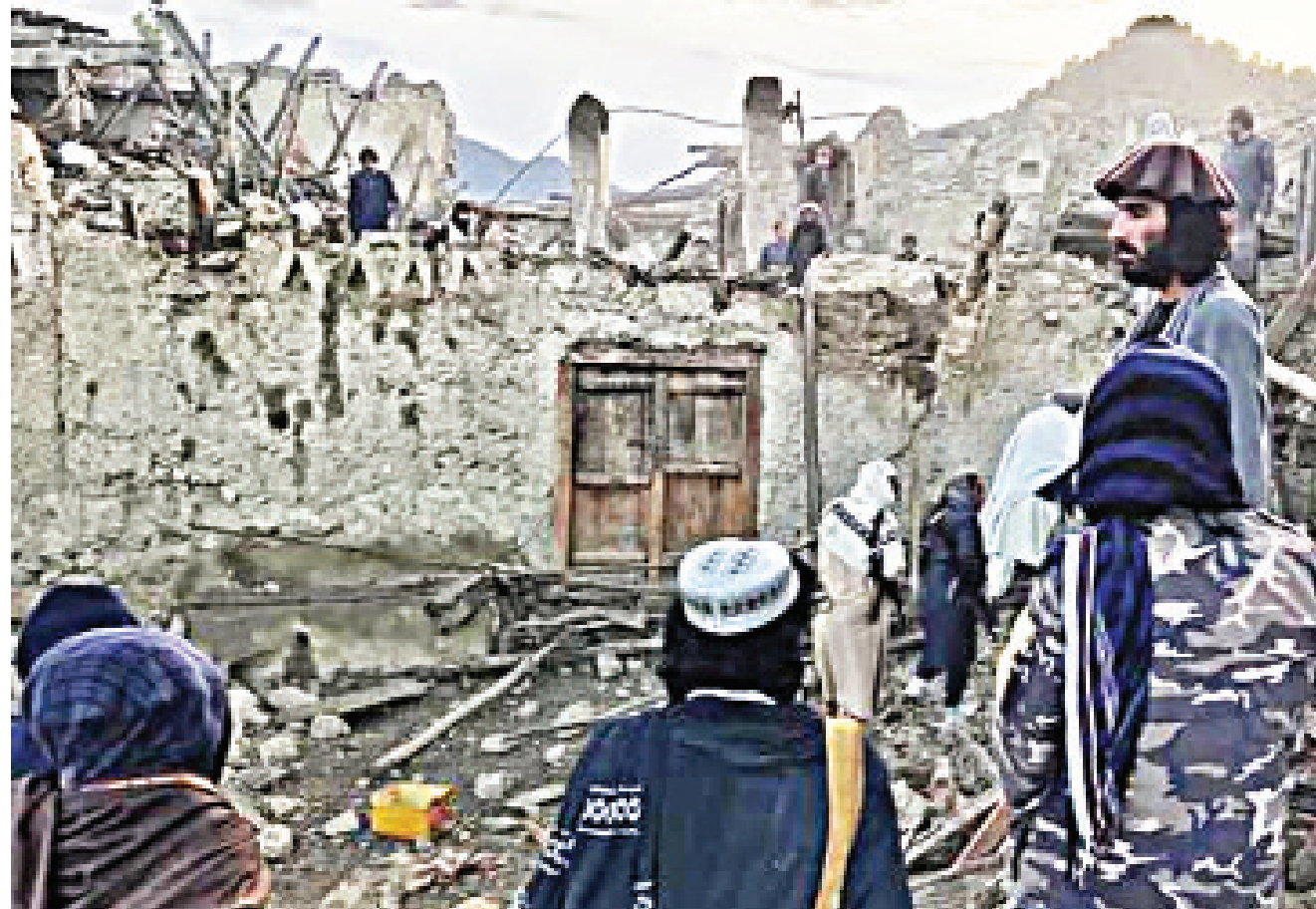
In this photo released by state-run news agency Bakhtar, Afghans look at destruction caused by an earthquake in the province of Paktika, eastern Afghanistan, yesterday.