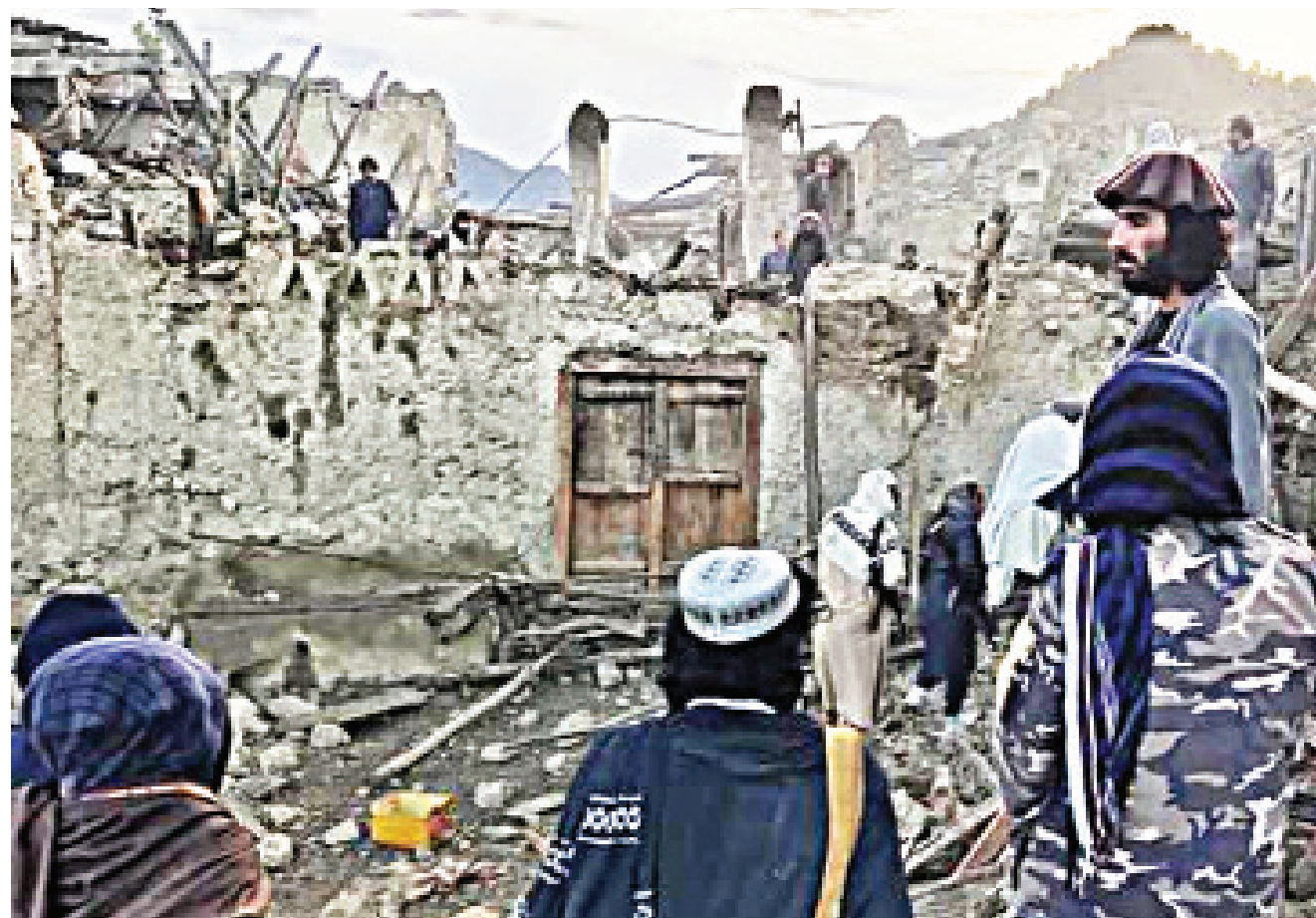
In this photo released by state-run news agency Bakhtar, Afghans look at destruction caused by an earthquake in the province of Paktika, eastern Afghanistan, yesterday.