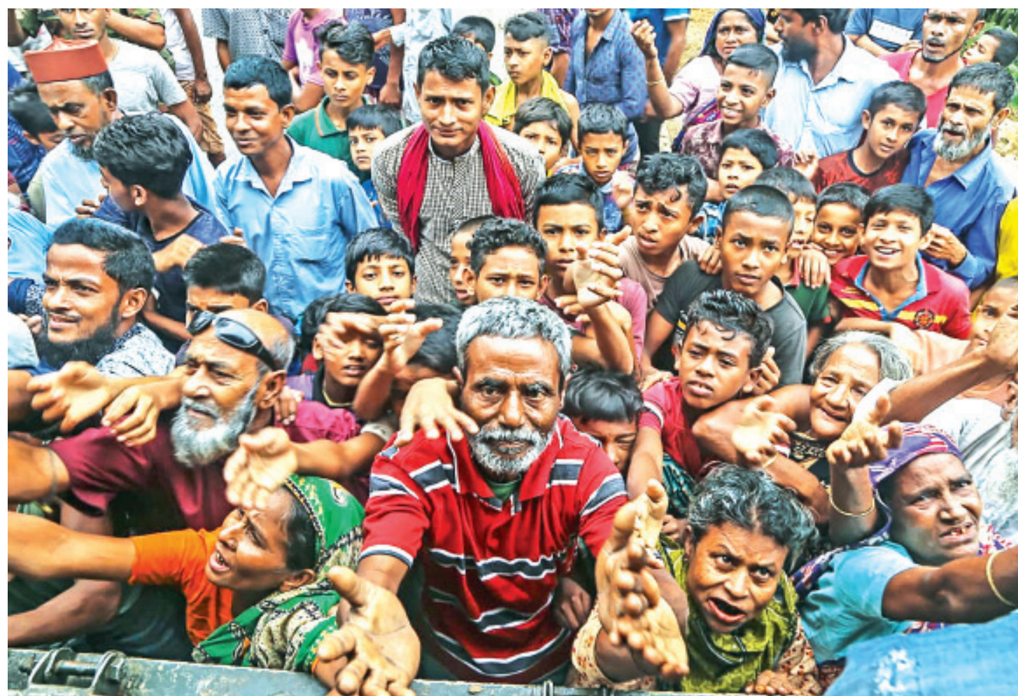
Flood affected people stretch their arms to collect relief material near a flooded area following heavy monsoon rainfalls on the outskirts of Sylhet yesterday.