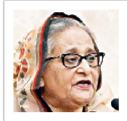
UNB, BSS, Dhaka

Describing the Padma Bridge as the symbol of national pride, Prime Minister Sheikh Hasina yesterday said no one can raise questions about the quality of the bridge which opens on Saturday.