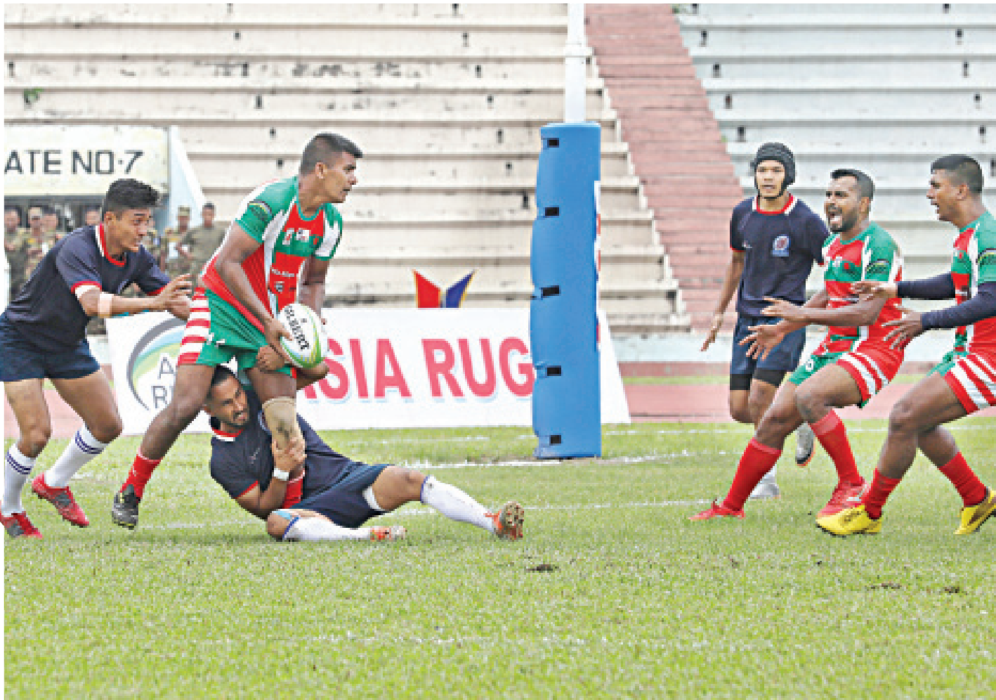
A Bangladesh player, being pulled back by his Nepalese counterpart, passes the ball to a teammate during their first match of the three-match friendship series at the Army Stadium in Banani yesterday. Bangladesh blanked the visitors 20-0 in this seven-a-side match, which was the first-ever international rugby match held on Bangladesh soil.

Wimbledon champion Novak Djokovic will head into next week's tournament as the men's top seed with Russian world number one Daniil Medvedev banned from taking part while Germany's second-ranked Alexander Zverev is out injured. Djokovic, who was unable to defend his 2021 Australian Open title and the 2,000 ranking points he earned due to his non-vaccinated status against COVID-19, recently lost his world number one spot to Medvedev. The Serbian, who has won the last three editions of the grasscourt major, will slip further down the rankings after Wimbledon as he will lose another 2,000 points with the ATP and WTA stripping the tournament of points. Poland's world number one Iga Swiatek will be the women's top seed.