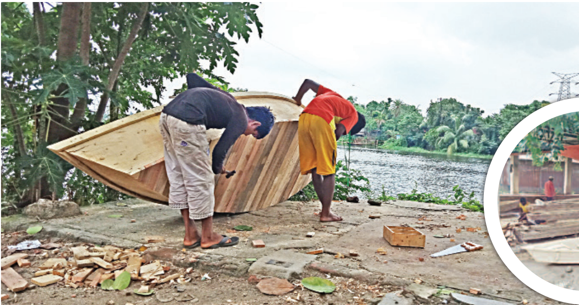
Boatmakers busy at work at Kayetpara market. In light of the flood situation in Sylhet, the demand for boats has increased, as many residents of Dhaka’s low-lying areas fear they might suffer the same fate if the water level of surrounding canals keep increasing. This photo was taken yesterday.