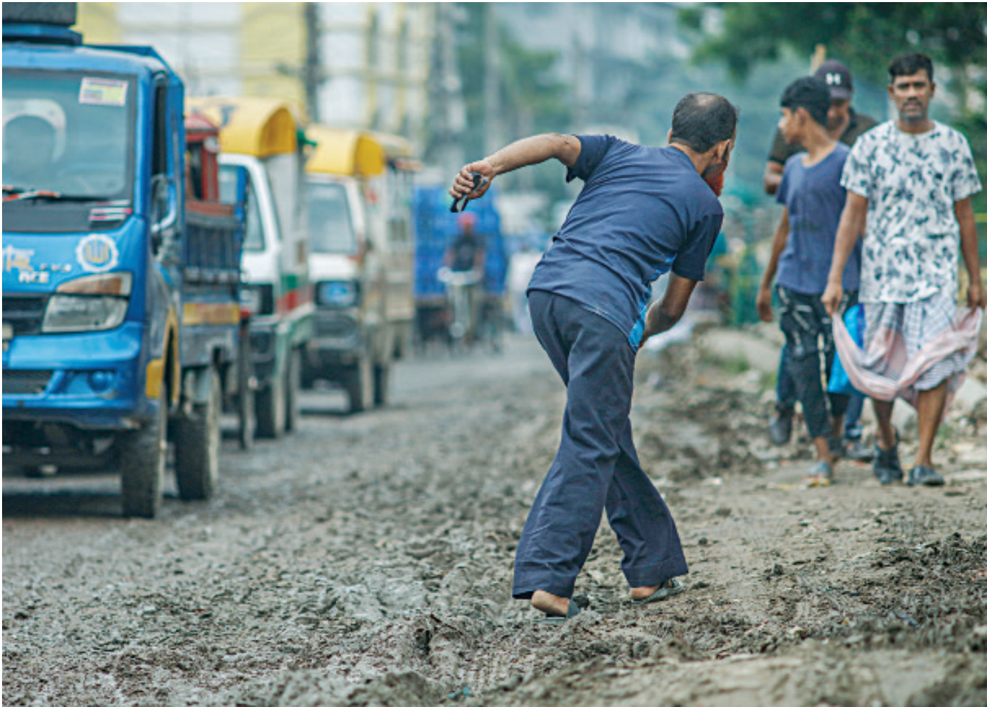
A pedestrian balances himself as he almost slips on the mud accumulated on Beribadh Road in Hajeribagh. In the effect of the downpour over the last few days, the road has turned quite risky to tread on.

Rizvi also criticised the government for its move to shut down stores and shopping malls after 8:00pm since it has long been claiming to have the capacity of providing an uninterrupted electricity supply.